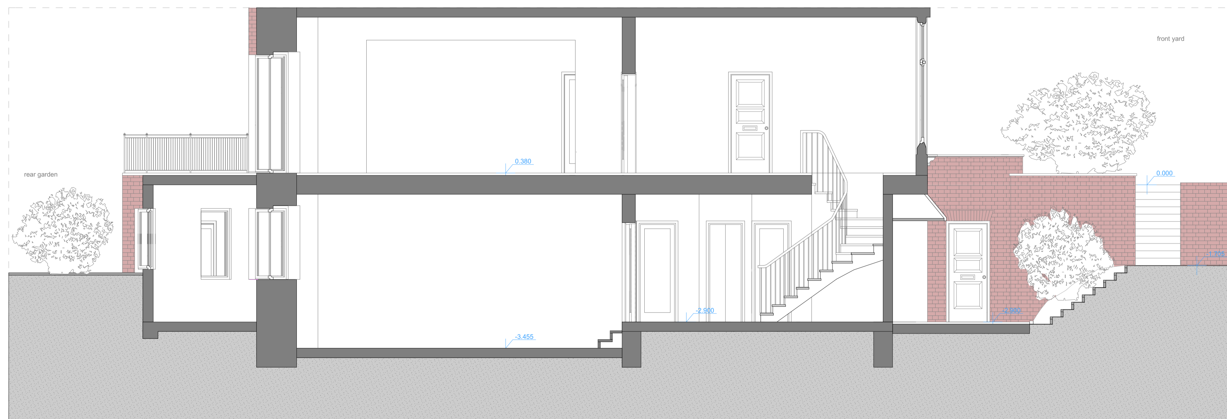
PROPOSED - SECTION 1-1