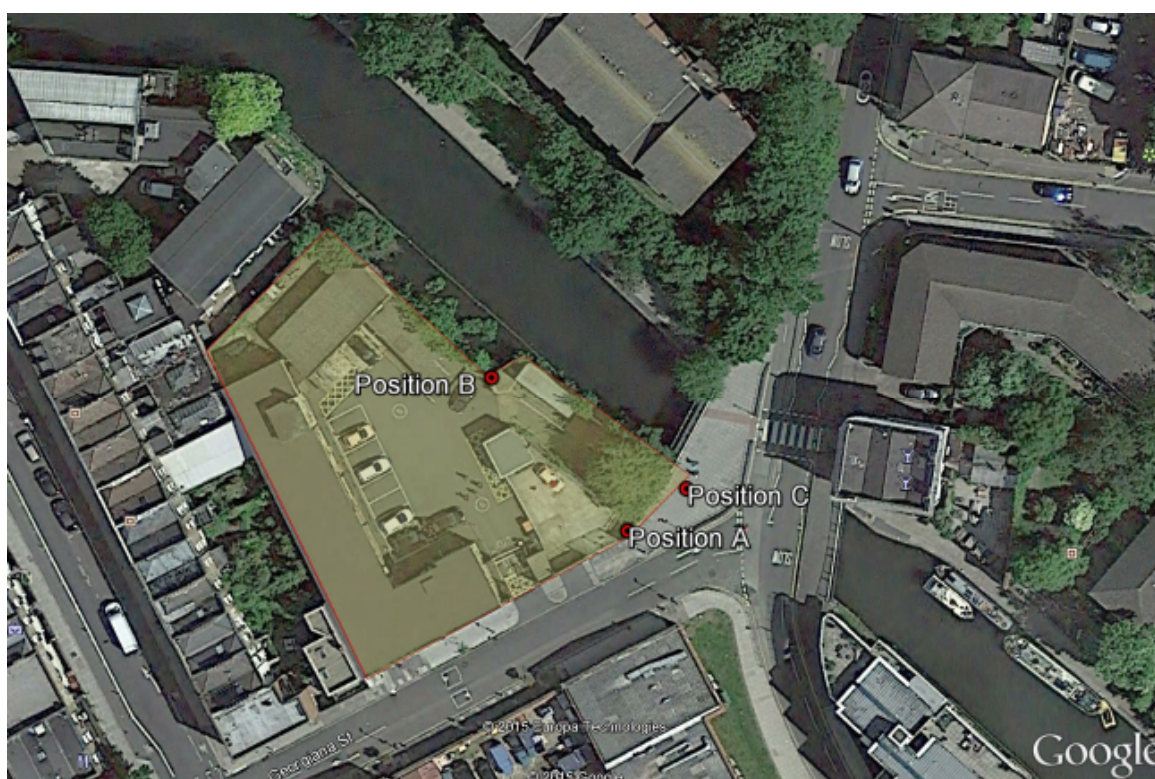
Figure 1: Monitoring locations