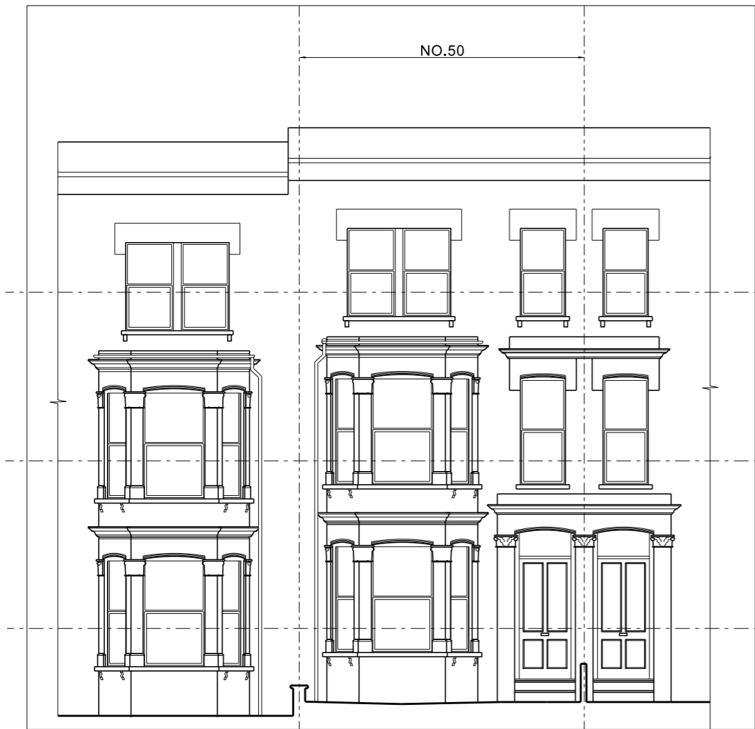
01/1530-GA-300 FRONT ELEVATION PROPOSED