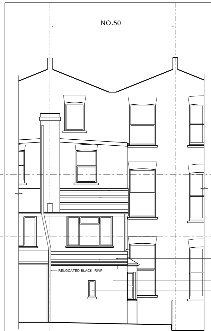
02/1530-GA-300 REAR ELEVATION PROPOSED

+2 (FRONT) FFL 16,440 ▽ +2 (REAR) FFL 14,670 ▽ +1 (FRONT) FFL 13,210 ▽ +1 (REAR) FFL 12,050 ▽ +G (FRONT) FFL 10,000 ▽ +G (REAR) FFL 9,500 ▽