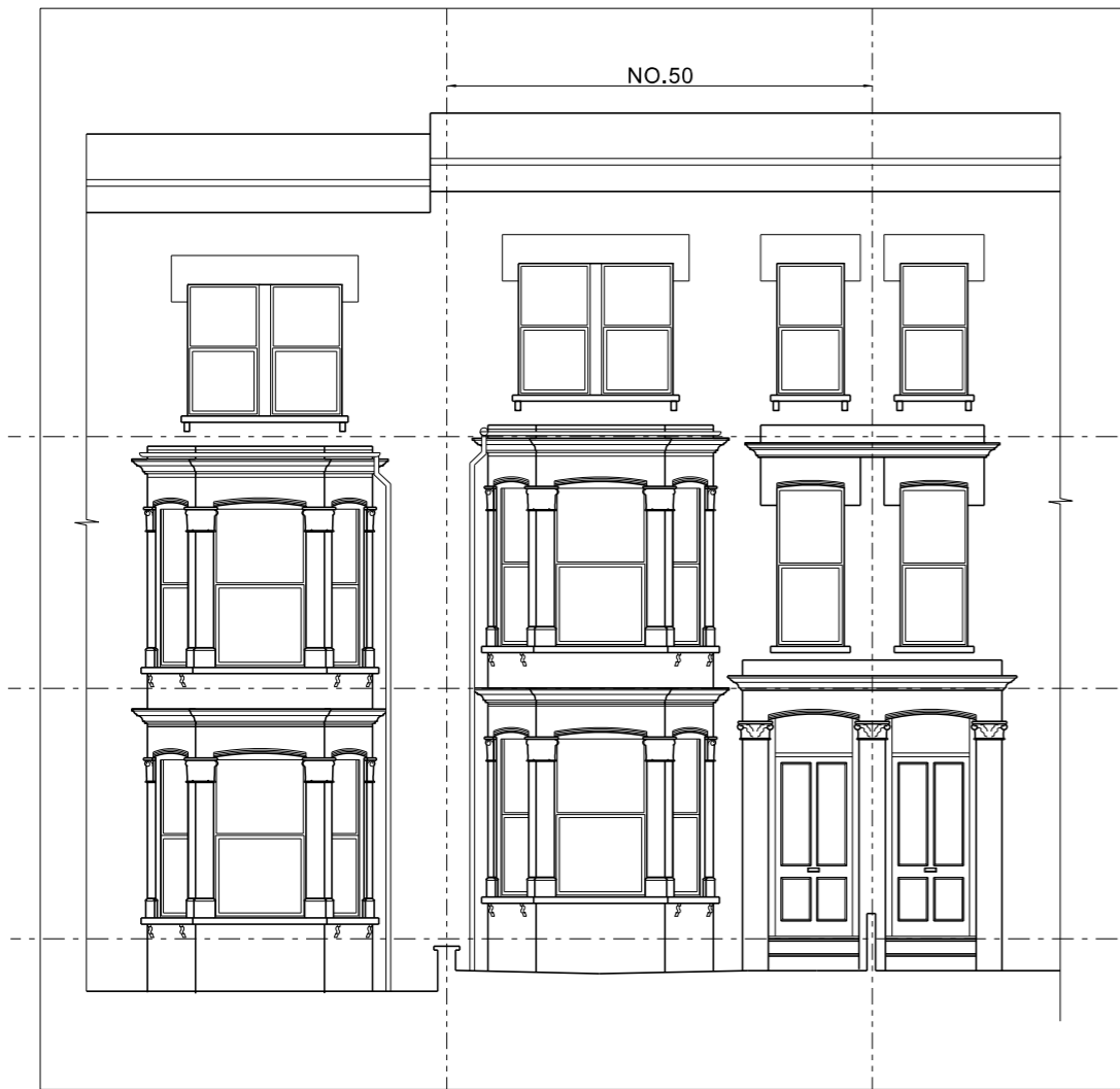
01/1530-EX-300 FRONT ELEVATION EXISTING

+2 (FRONT) FFL 16,440 ▽ +2 (REAR) FFL 14,670 ▽ +1 (FRONT) FFL 13,210 ▽ +1 (REAR) FFL 12,050 ▽ +G (FRONT) FFL 10,000 ▽ +G (REAR) FFL 9,500 ▽