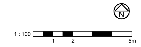
Existing Third Floor Plan