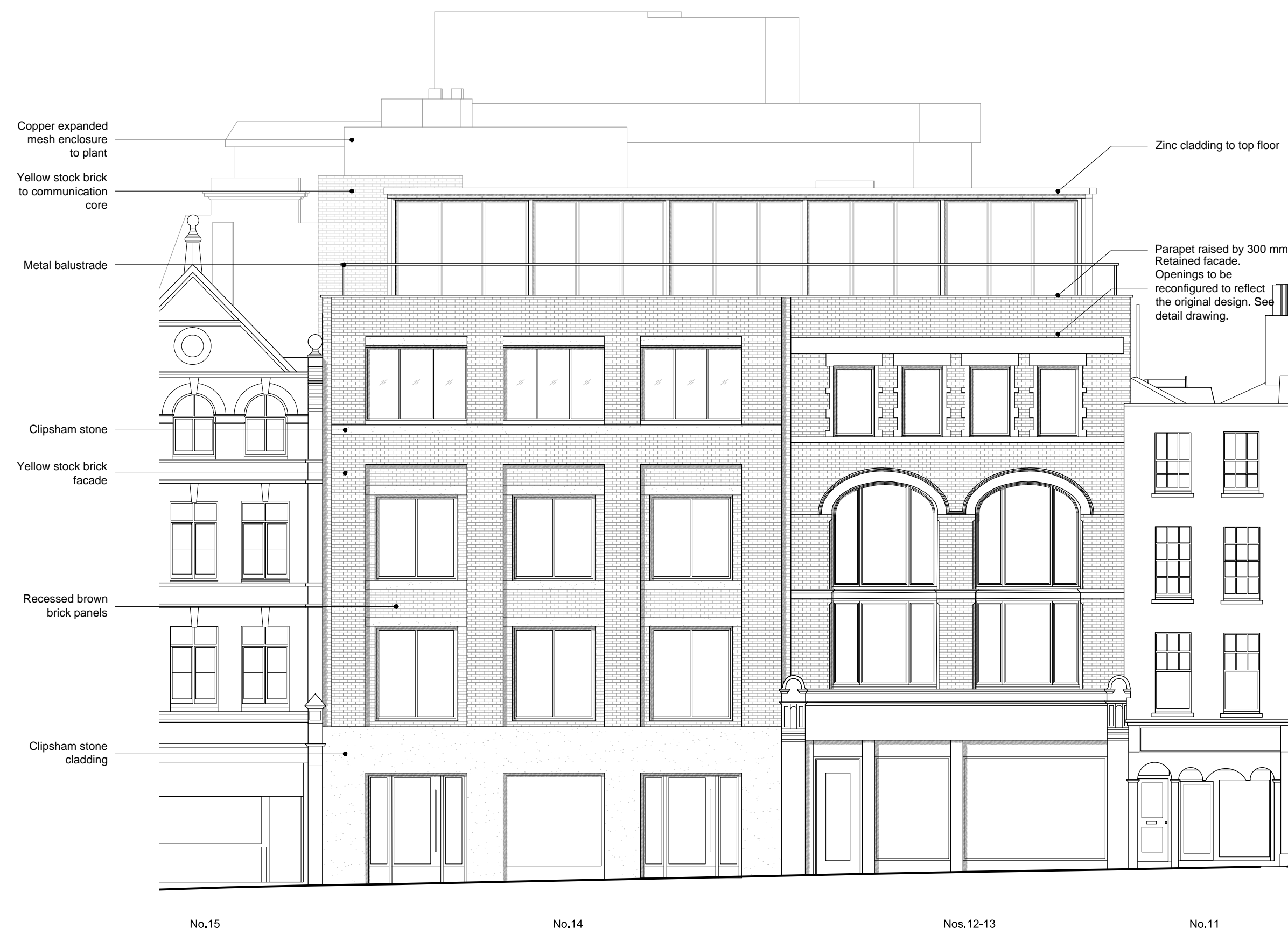
Elevation 1 - Greville Street