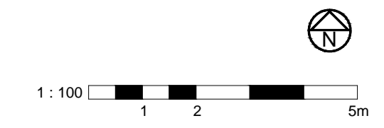
Fourth Floor Demolition Plan

PROJECT NO. DRAWING NO. REV. 15229 55 P0