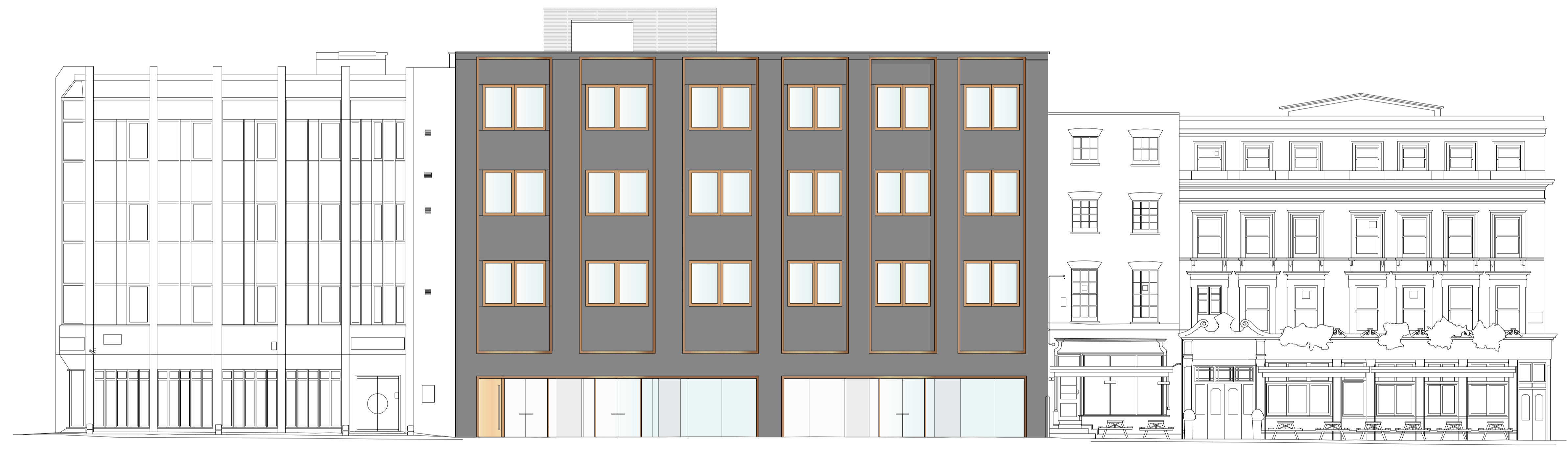
01 Proposed South Elevation 1:100 @ A1