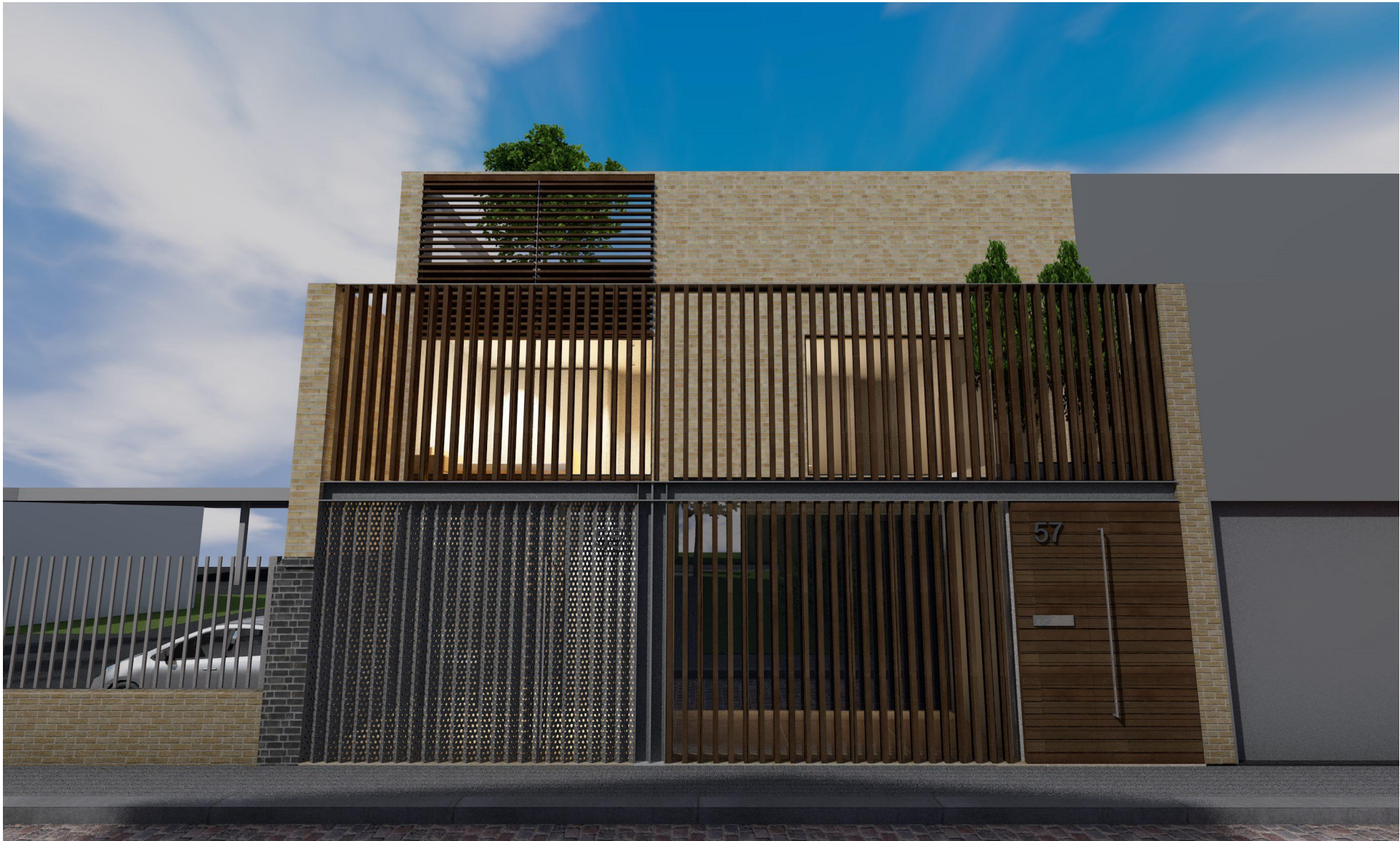
FRONT VIEW FROM ABINGDON CLOSE

Notes: This drawing is the property and copyright of John Kerr Associates and written consent must be obtained before divulging to a third party or copying whole or part of the drawing by any method whatsoever. All dimensions are to be checked on site prior to construction. Any discrepancies are to be reported to the architect before works commence. All dimensions are in millimeters. Do not scale dimension. This drawing is to be read in conjunction with the specification and with all relevant consultants'/specialists' drawings and/or documents. All relevant Statutory Approvals to be obtained before works commence. revision date comments