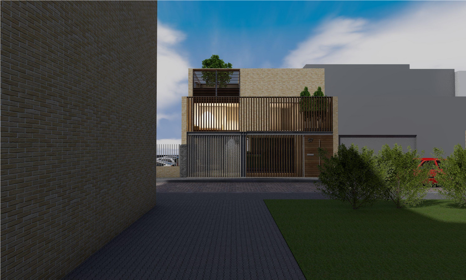
FRONT VIEW FROM ABINGDON CLOSE

Notes: This drawing is the property and copyright of John Kerr Associates and written consent must be obtained before divulging to a third party or copying whole or part of the drawing by any method whatsoever. All dimensions are to be checked on site prior to construction. Any discrepancies are to be reported to the architect before works commence. All dimensions are in millimeters. Do not scale dimension. This drawing is to be read in conjunction with the specification and with all relevant consultants'/specialists' drawings and/or documents. All relevant Statutory Approvals to be obtained before works commence. revision date comments