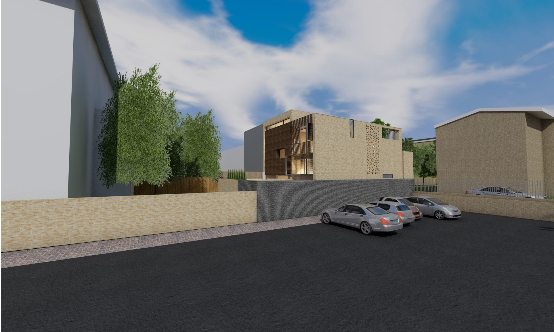
REAR VIEW FROM CAMDEN ROAD

Notes: This drawing is the property and copyright of John Kerr Associates and written consent must be obtained before divulging to a third party or copying whole or part of the drawing by any method whatsoever. All dimensions are to be checked on site prior to construction. Any discrepancies are to be reported to the architect before works commence. All dimensions are in millimeters. Do not scale dimension. This drawing is to be read in conjunction with the specification and with all relevant consultants'/specialists' drawings and/or documents. All relevant Statutory Approvals to be obtained before works commence. revision date comments