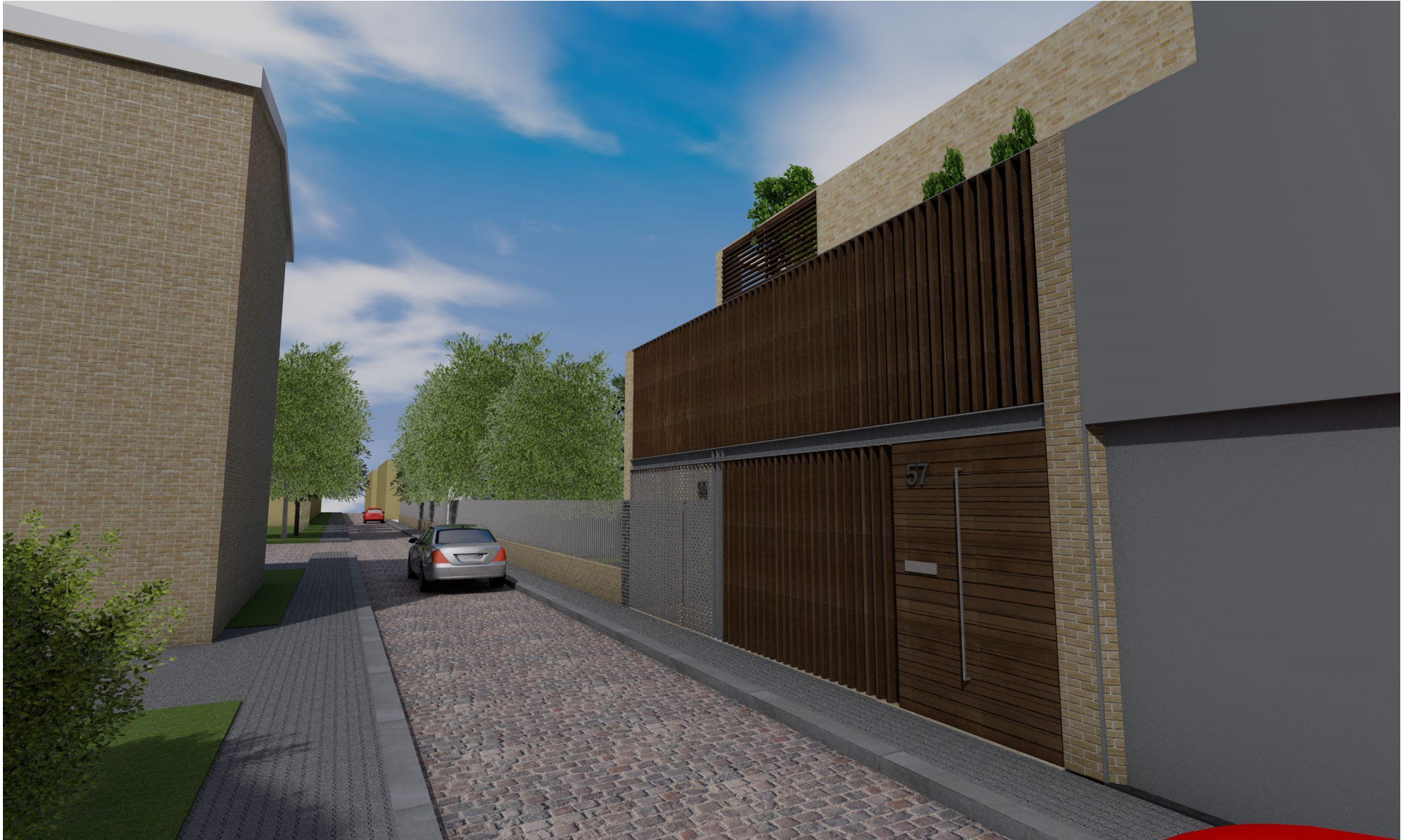
VIEW FROM CAMDEN MEWS