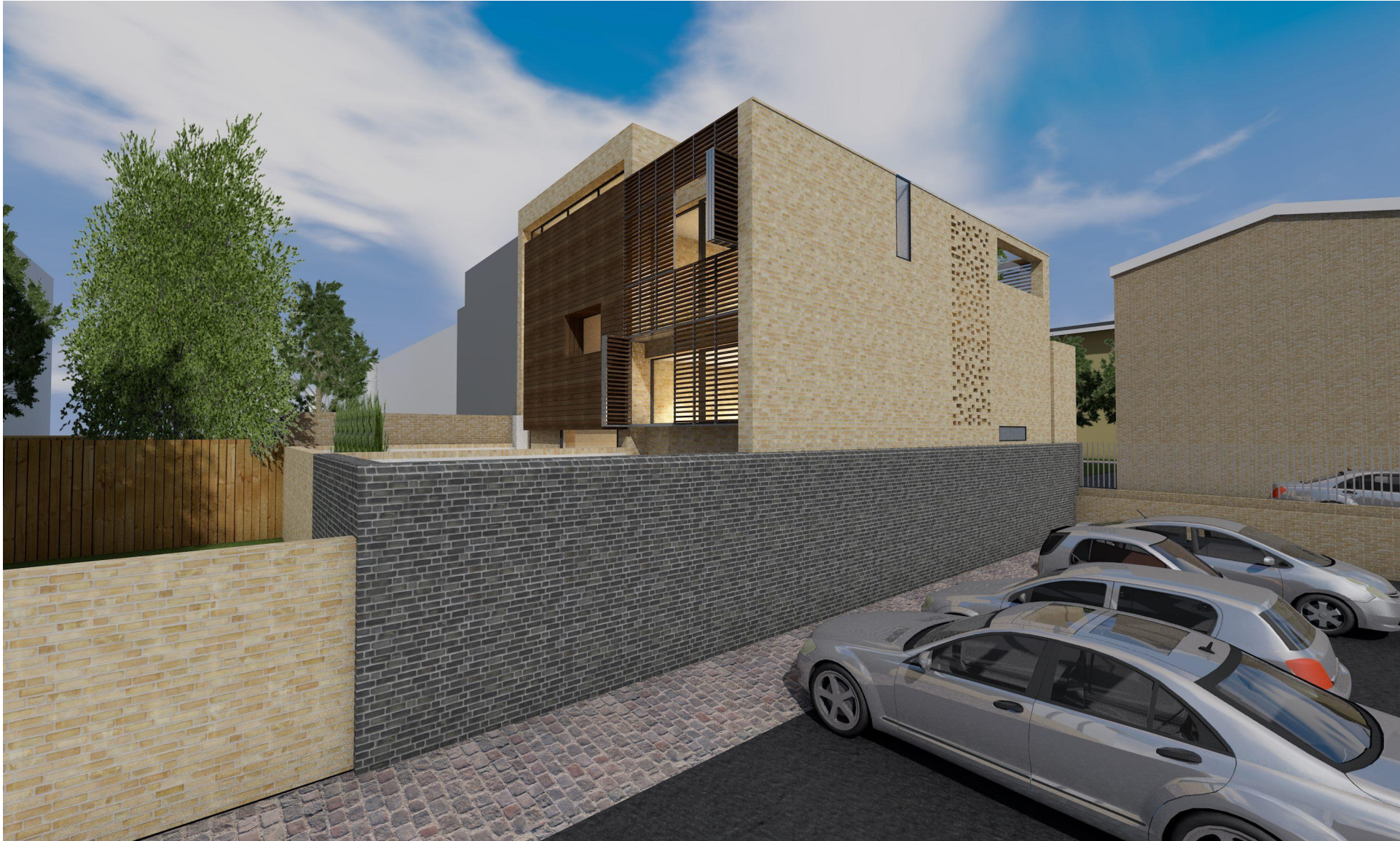
REAR VIEW FROM CAMDEN ROAD