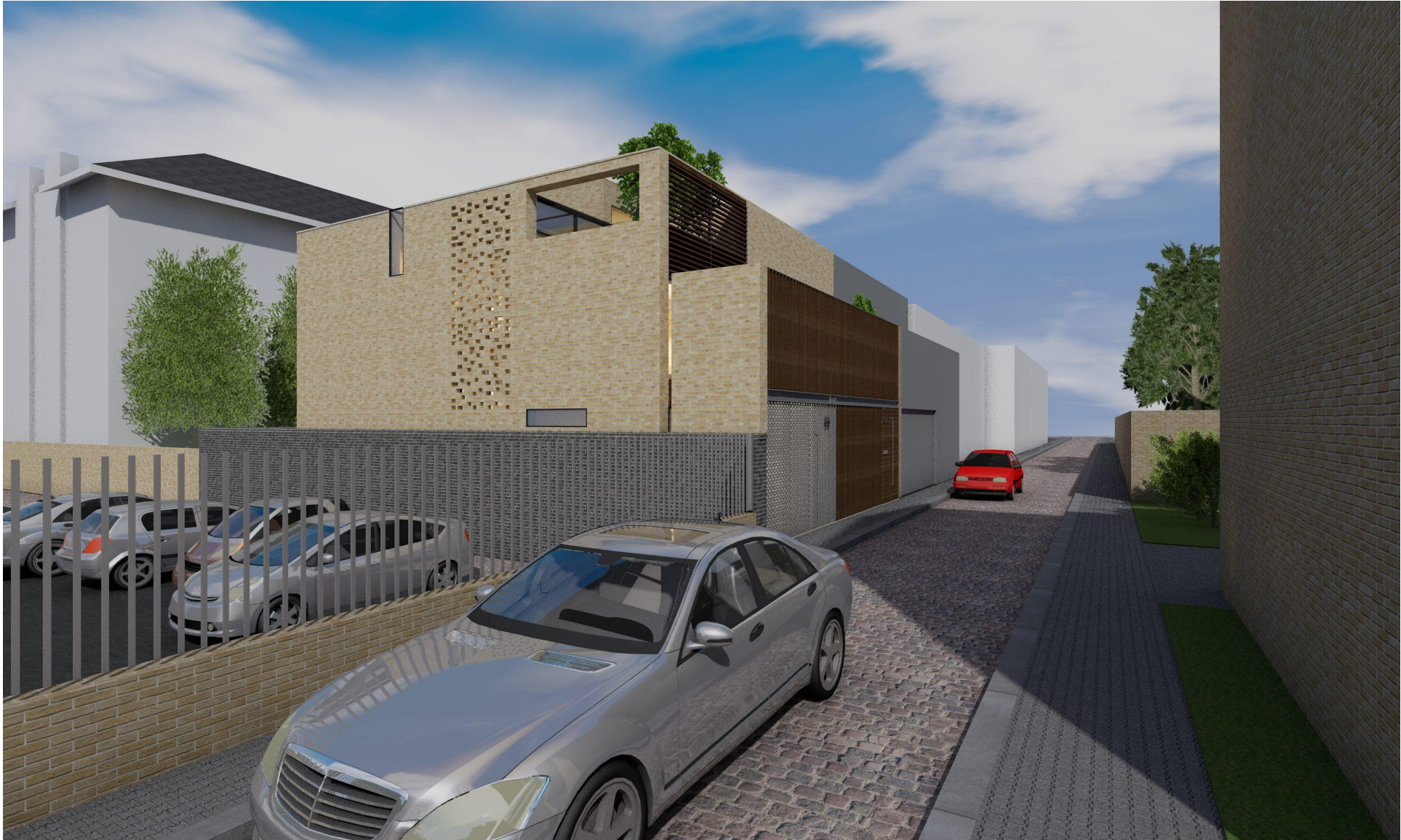
SIDE VIEW FROM ABINGDON CLOSE

Notes: This drawing is the property and copyright of John Kerr Associates and written consent must be obtained before divulging to a third party or copying whole or part of the drawing by any method whatsoever. All dimensions are to be checked on site prior to construction. Any discrepancies are to be reported to the architect before works commence. All dimensions are in millimeters. Do not scale dimension. This drawing is to be read in conjunction with the specification and with all relevant consultants'/specialists' drawings and/or documents. All relevant Statutory Approvals to be obtained before works commence. revision date comments