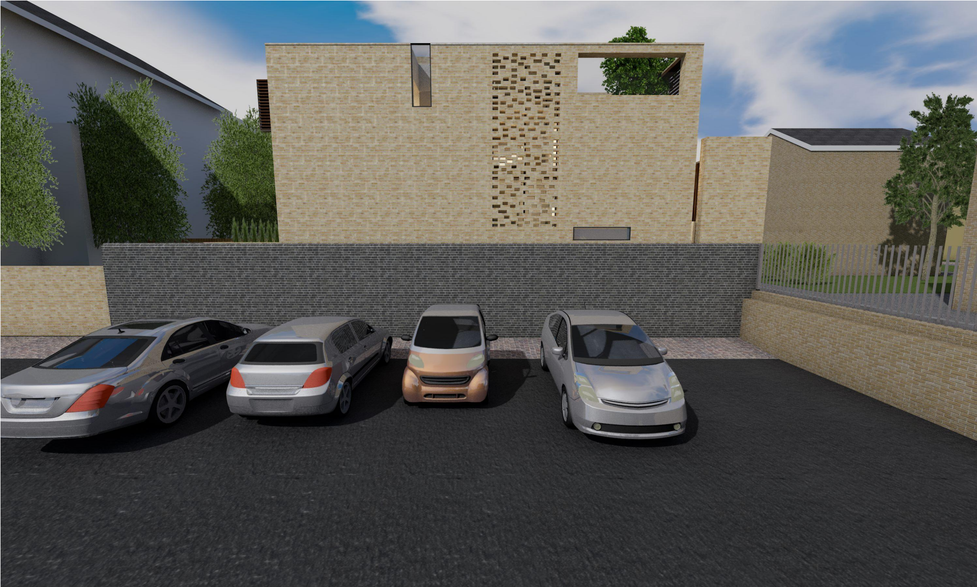
SIDE VIEW CAR PARK

Notes: This drawing is the property and copyright of John Kerr Associates and written consent must be obtained before divulging to a third party or copying whole or part of the drawing by any method whatsoever. All dimensions are to be checked on site prior to construction. Any discrepancies are to be reported to the architect before works commence. All dimensions are in millimeters. Do not scale dimension. This drawing is to be read in conjunction with the specification and with all relevant consultants'/specialists' drawings and/or documents. All relevant Statutory Approvals to be obtained before works commence. revision date comments