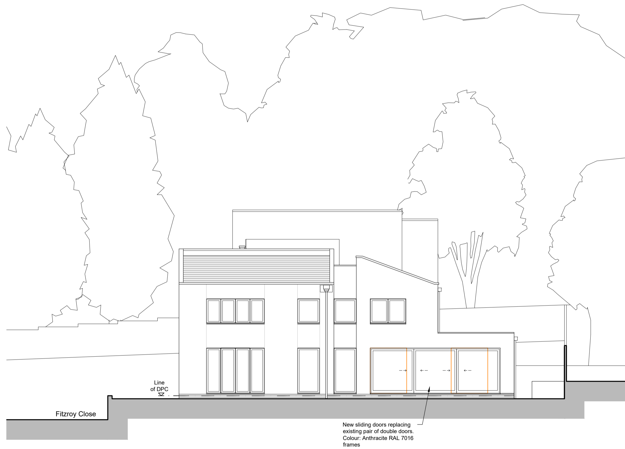
West Elevation (Side)