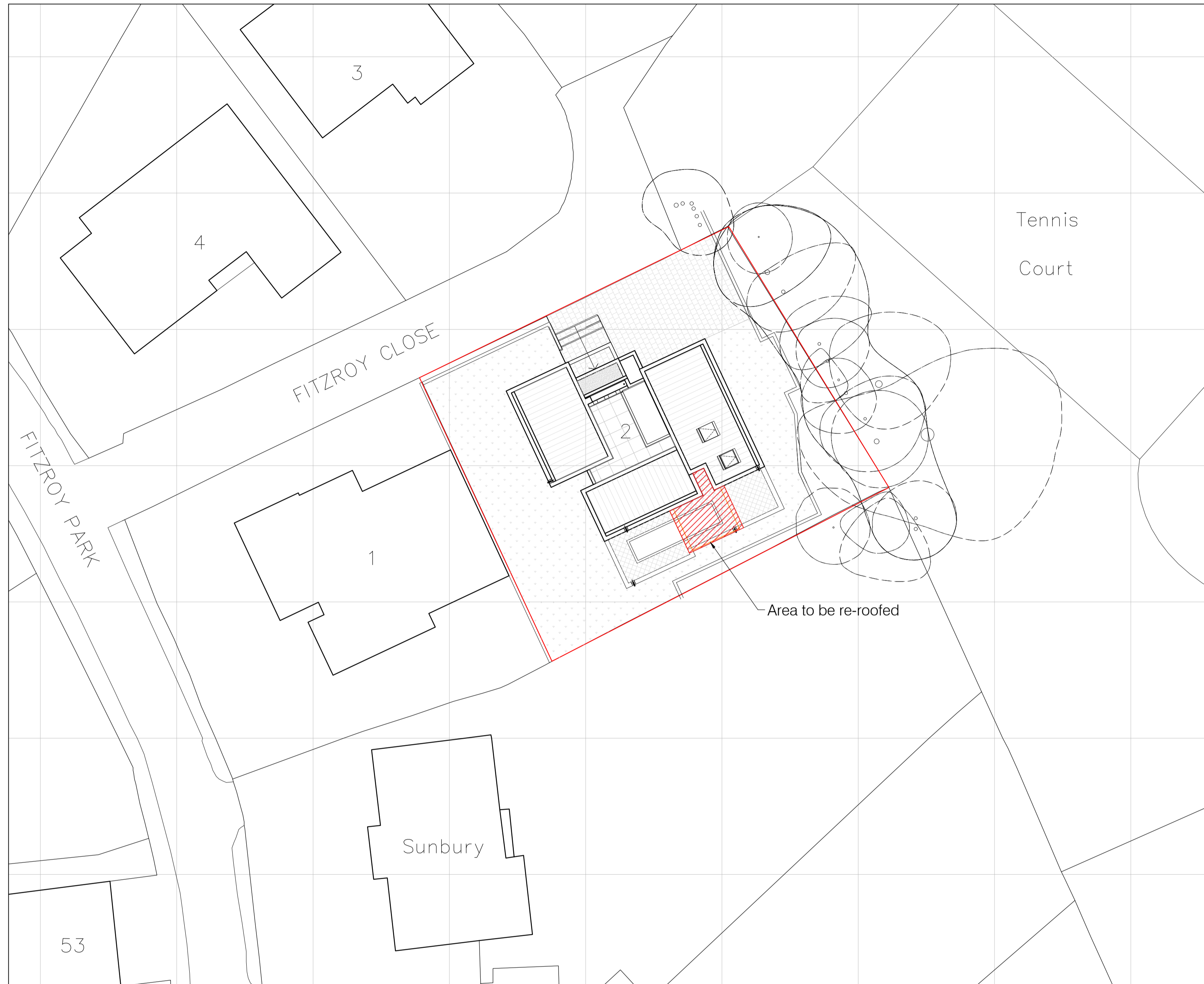
Block Plan Scale 1:200