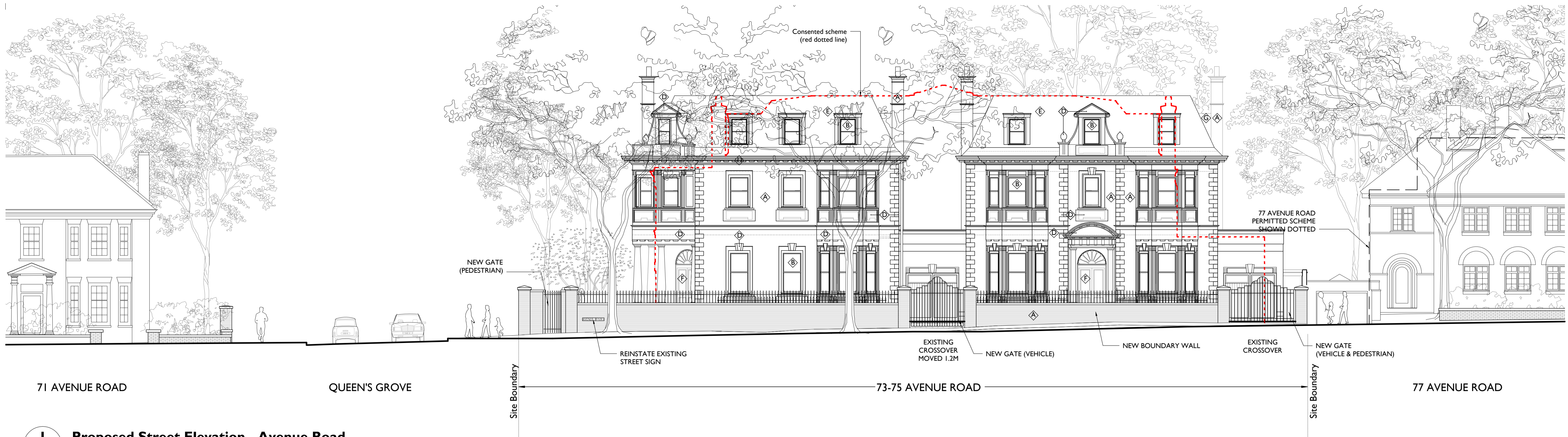
1 Proposed Street Elevation - Avenue Road 235 I:100 @ A1