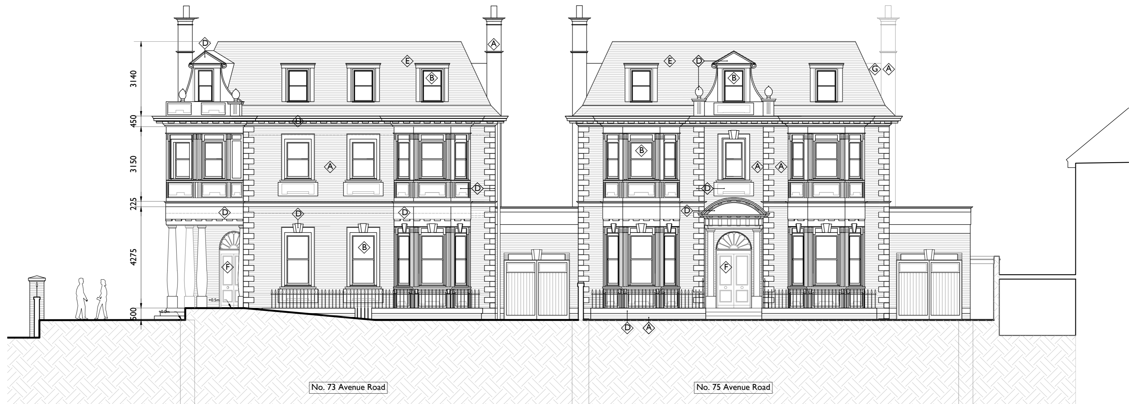
I 73-75 Avenue Road: Proposed Front Elevation 230 1:100@A2