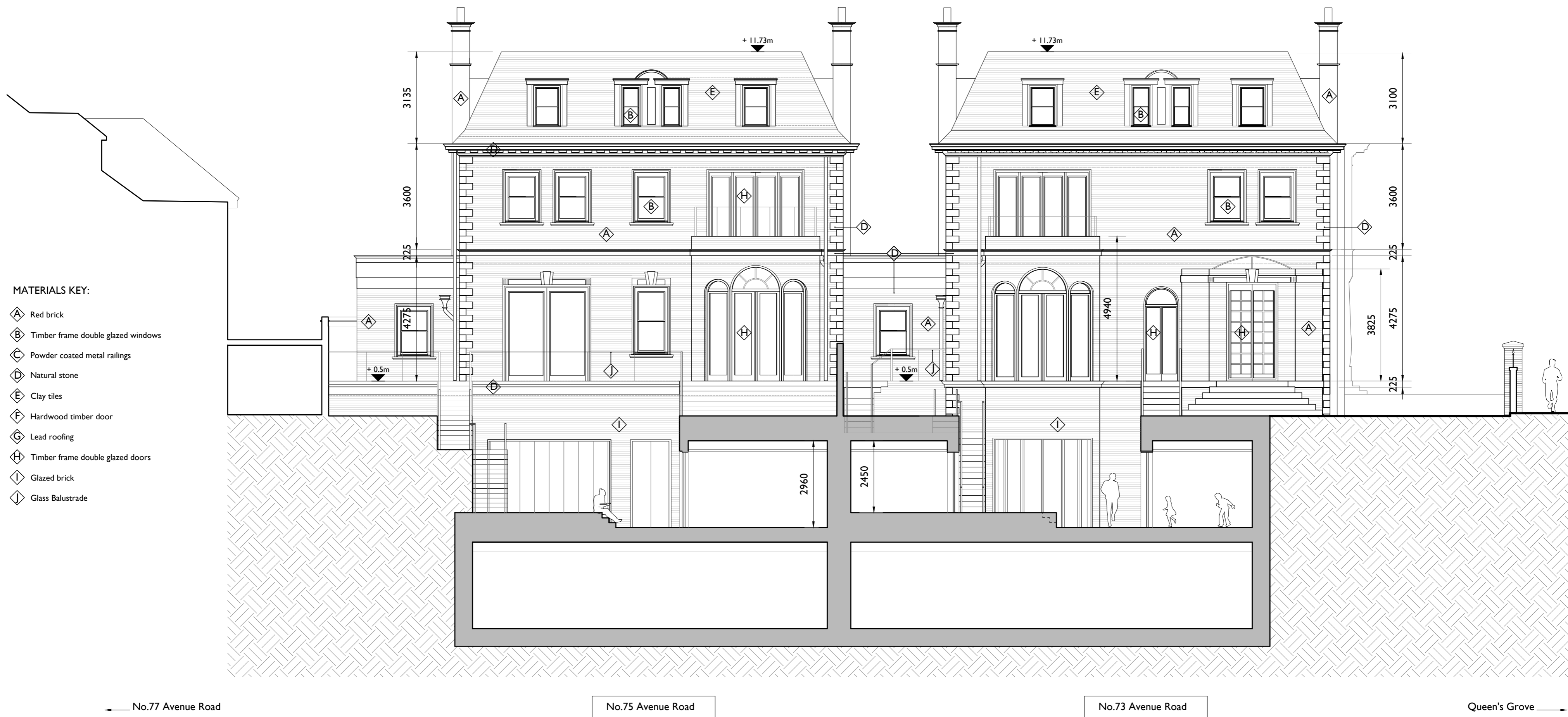
I 73-75 Avenue Road: Proposed Rear Elevation 231 1:100@A2