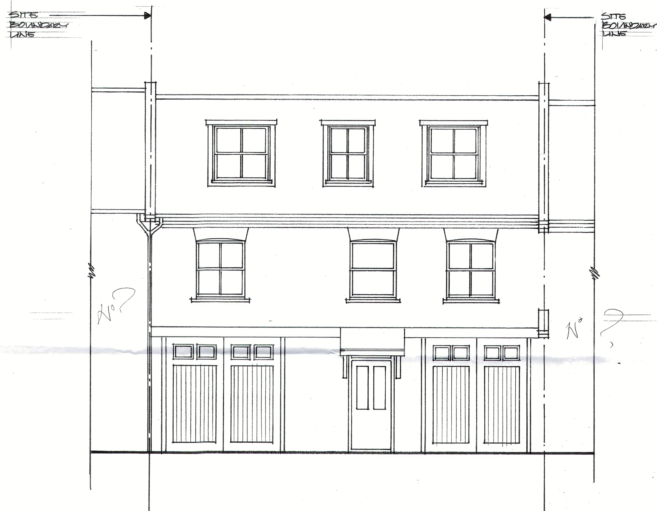
EXISTING FRONT ELEVATION ROSEMOUNT ROAD