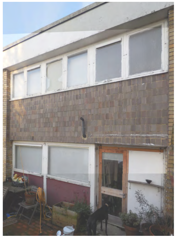
Photograph of existing rear elevation

Notes on existing and proposed windows and timber cladding material as per drawing 002