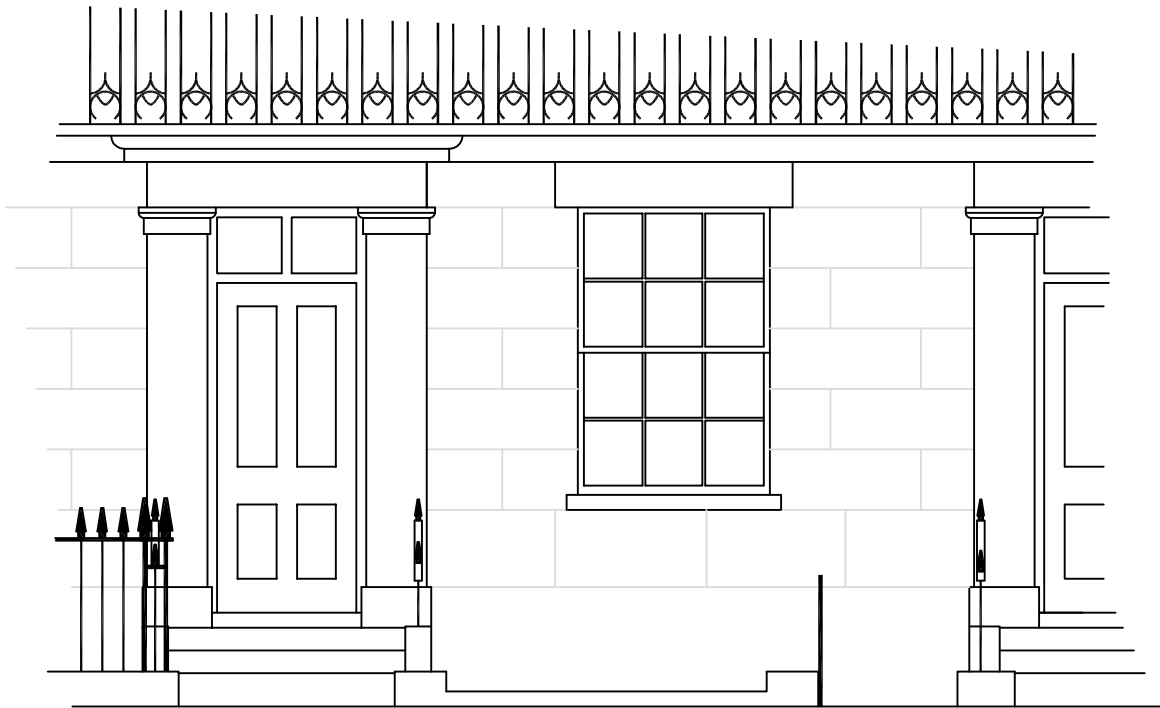
FRONT ELEVATION [EXISTING]