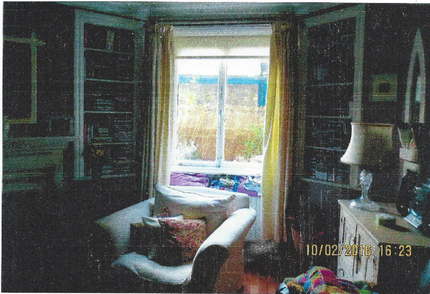
LIVING ROOM - NATURAL LIGHT AT PRESENT - 10/2/2016