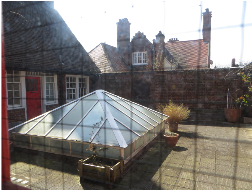
NON-ORIGINAL ROOF LANTERN TO BE REMOVED, MATCHING FLOOR TO BE PROVIDED IN LIEU