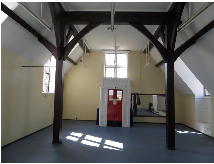
TIMBER FRAME STRUCTURE AND FIRE POLE ENCLOSURE RETAINED