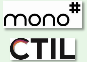
Image Prepared For: London In association with: Mono Consultants Ltd