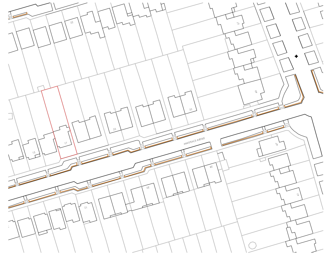
LOCATION PLAN - 1:1250