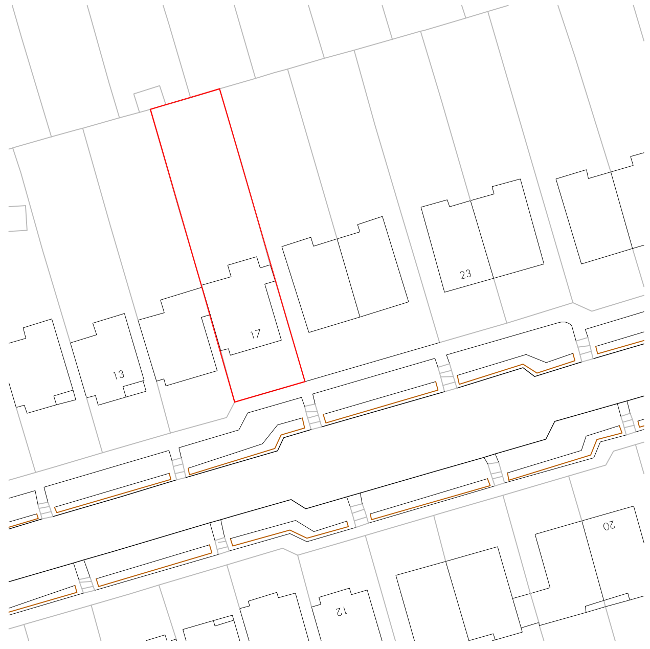
SITE PLAN - 1:500