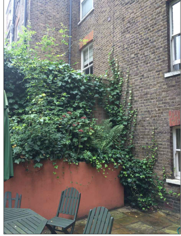
EXISTING MASONRY AND TIMBER GARDEN WALL ON A BOUNDARY WITH NO 23 KINGDON ROAD, APPROX HEIGHT 3.6M