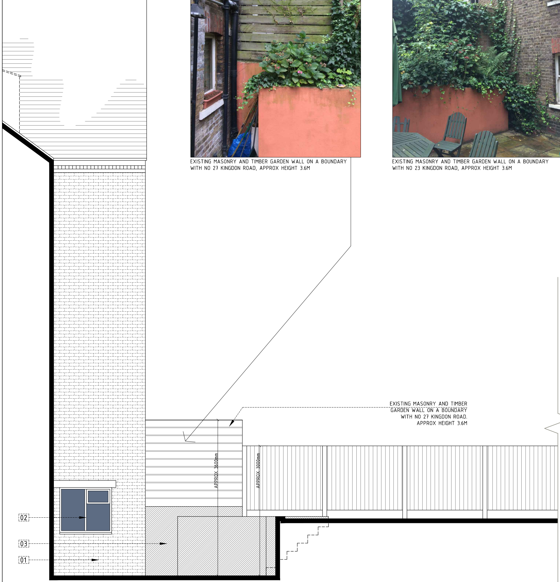
EXISTING MASONRY AND TIMBER GARDEN WALL ON A BOUNDARY WITH NO 27 KINGDON ROAD. APPROX HEIGHT 3.6M