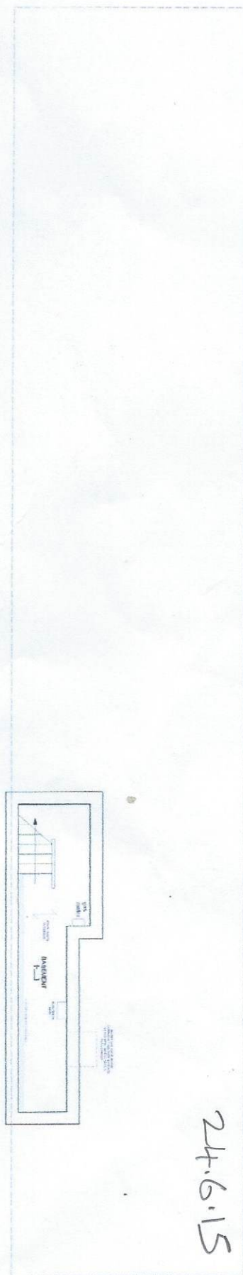
1 Basement Plan