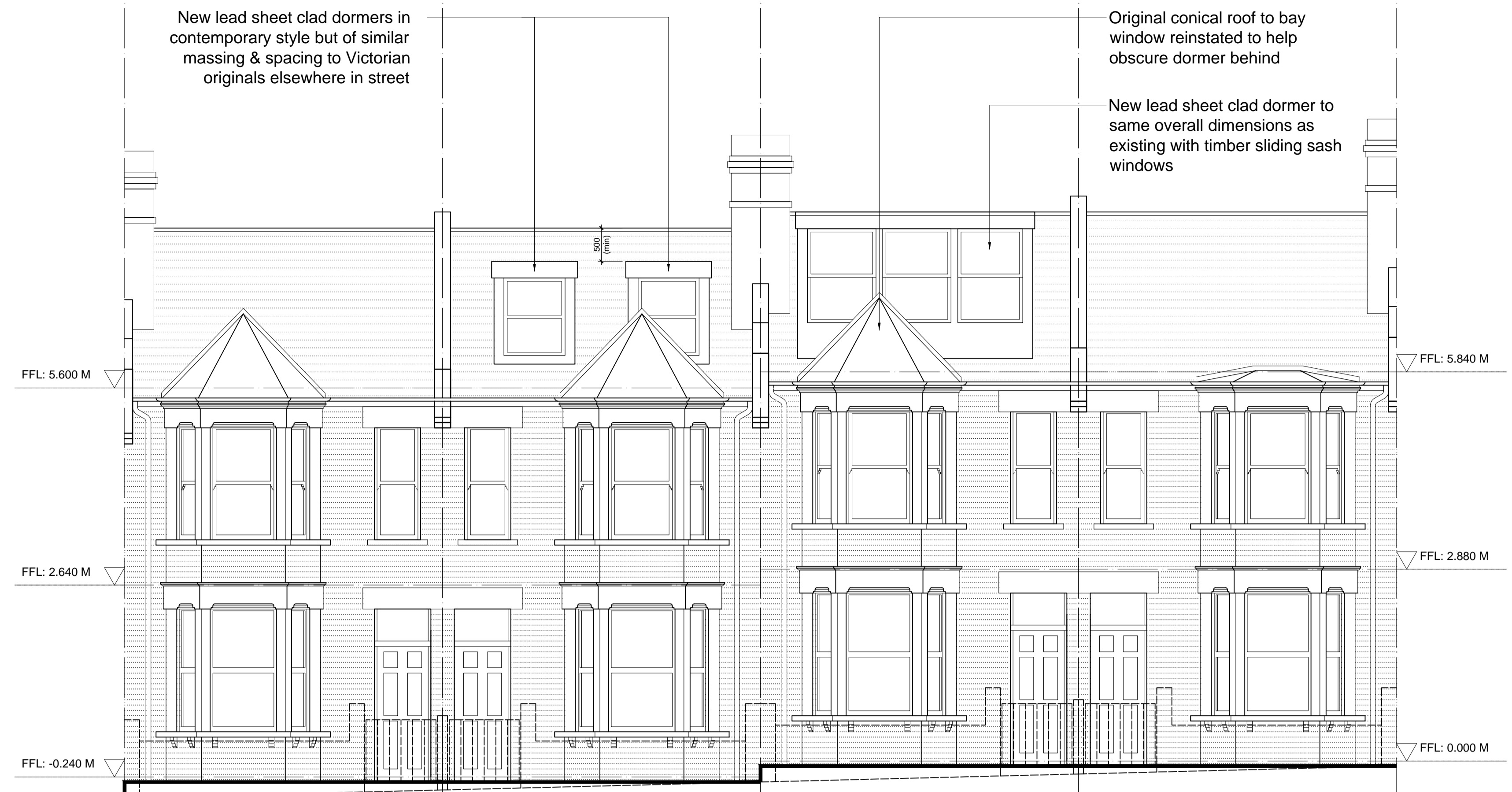
87 85 83 81 Front Elevation

The use of this data by the recipient acts as an agreement of the following statements. Do not use this data if you do not agree with any of the following statements. All drawings are based upon site information supplied by third parties and as such their accuracy cannot be guaranteed. All features are approximate and subject to clarification by a detailed topographical survey, statutory service enquiries and confirmation of the legal boundaries. Do not scale the drawing. Use figured dimensions in all cases. Check all dimensions on site. Report any discrepancies in writing to the originator before proceeding.