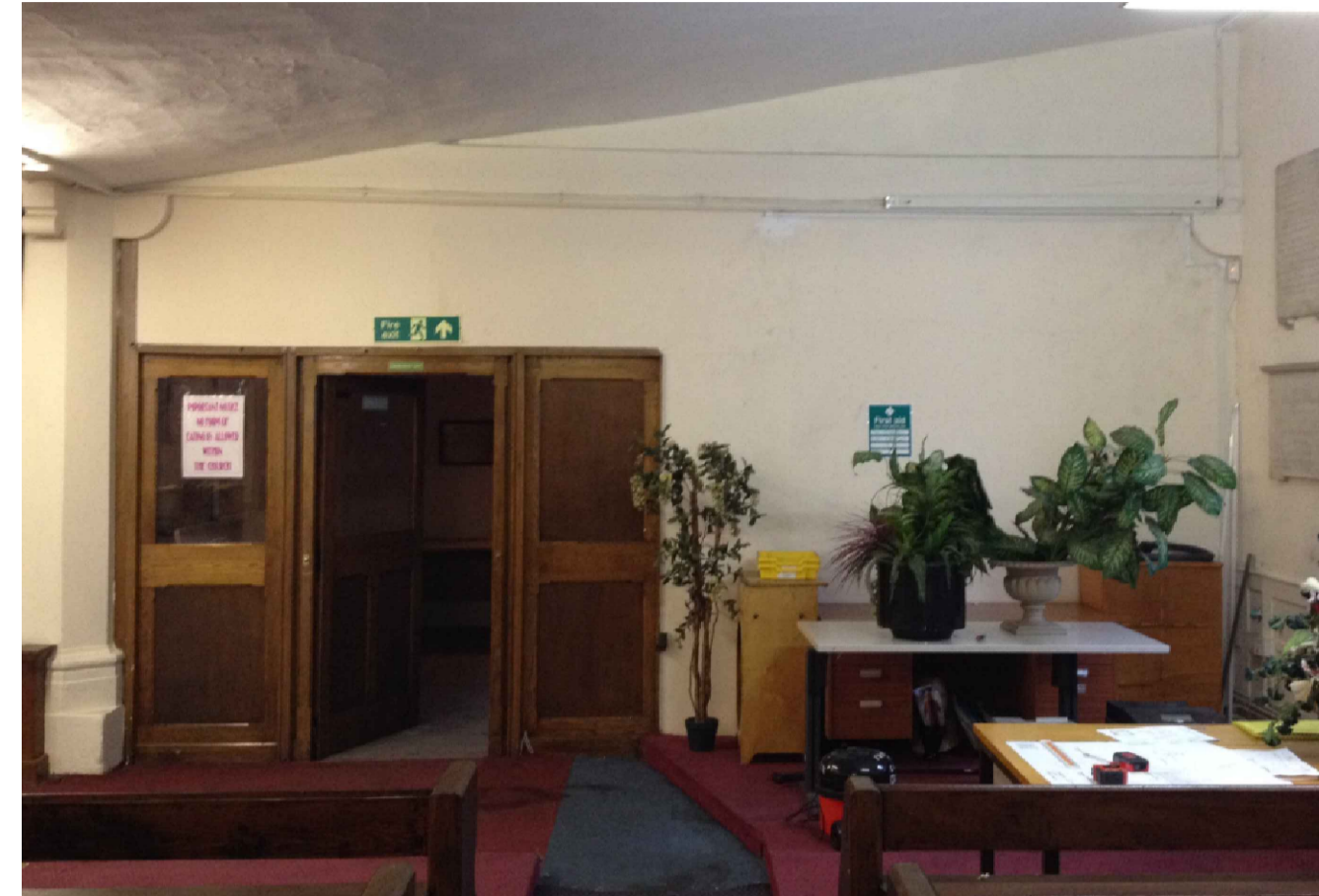
INTERNAL ELEVATION D SCALE @ 1:20

GAS SUPPLY PIPEWORK TO BE CORE DRILLED THROUGH GROUND FLOOR STRUCTURE FROM BASEMENT. EXISTING FLAG STONES TO BE REMOVED AND REINSTATED ON COMPLETION