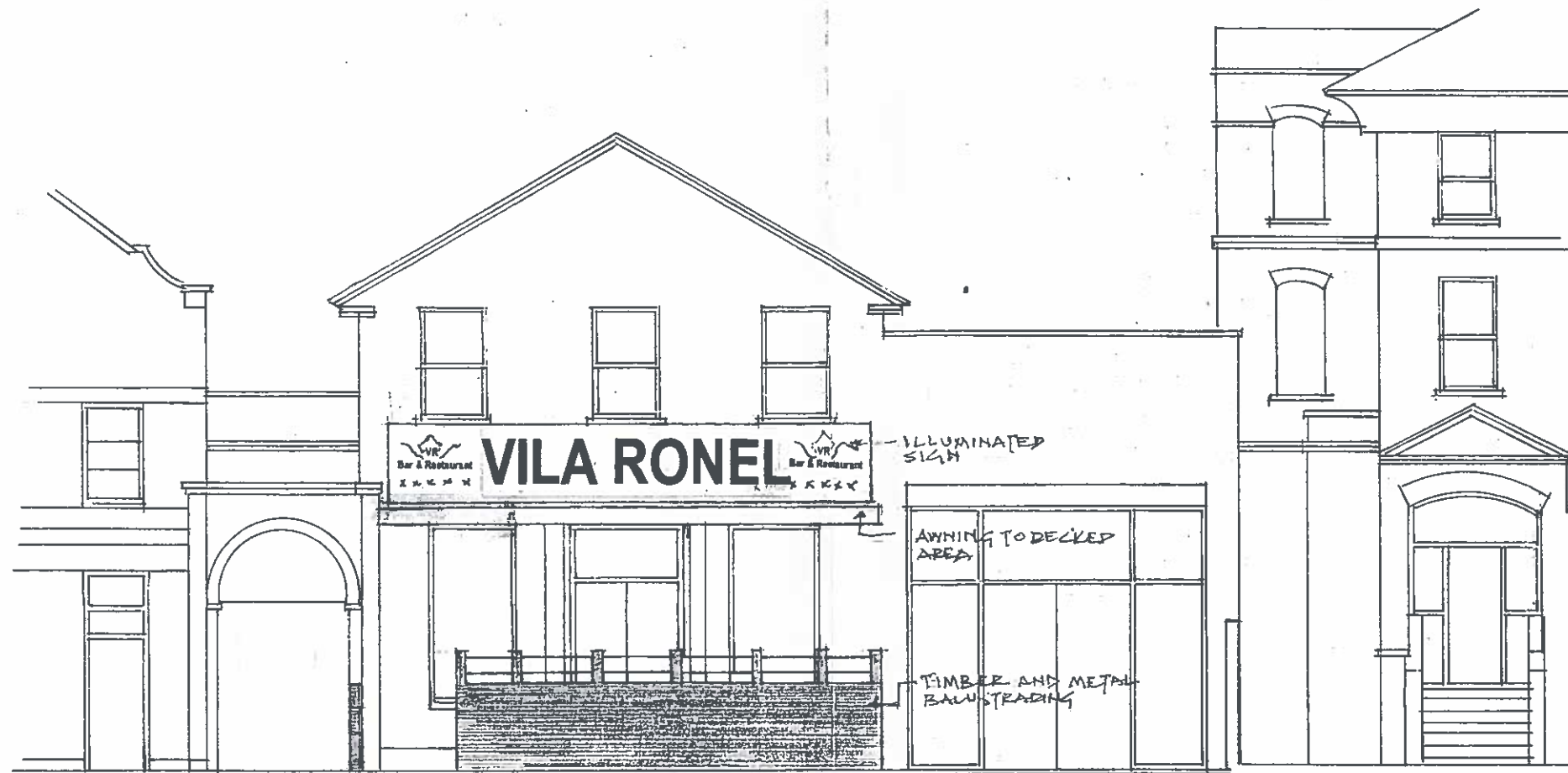
AS BUILT ELEVATION OF NO 46.