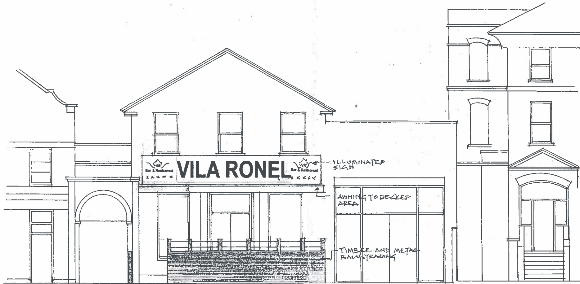
AS BUILT ELEVATION OF NO 46.