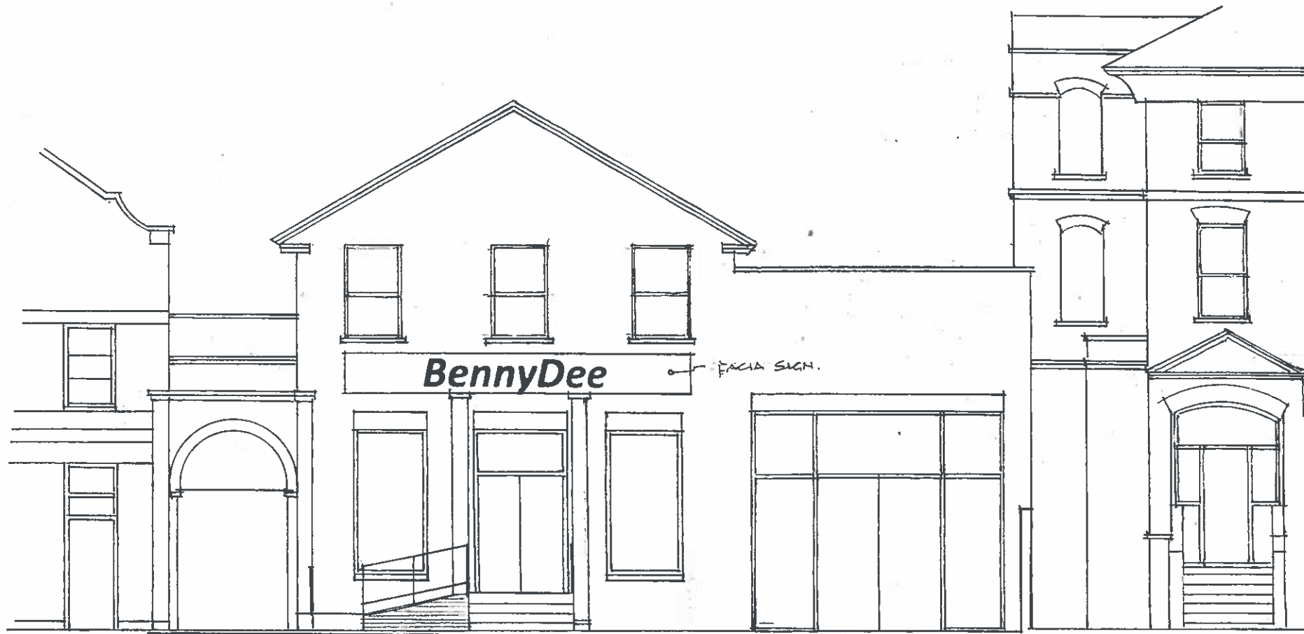
EXISTING ELEVATION TO NO. 46 & 44.