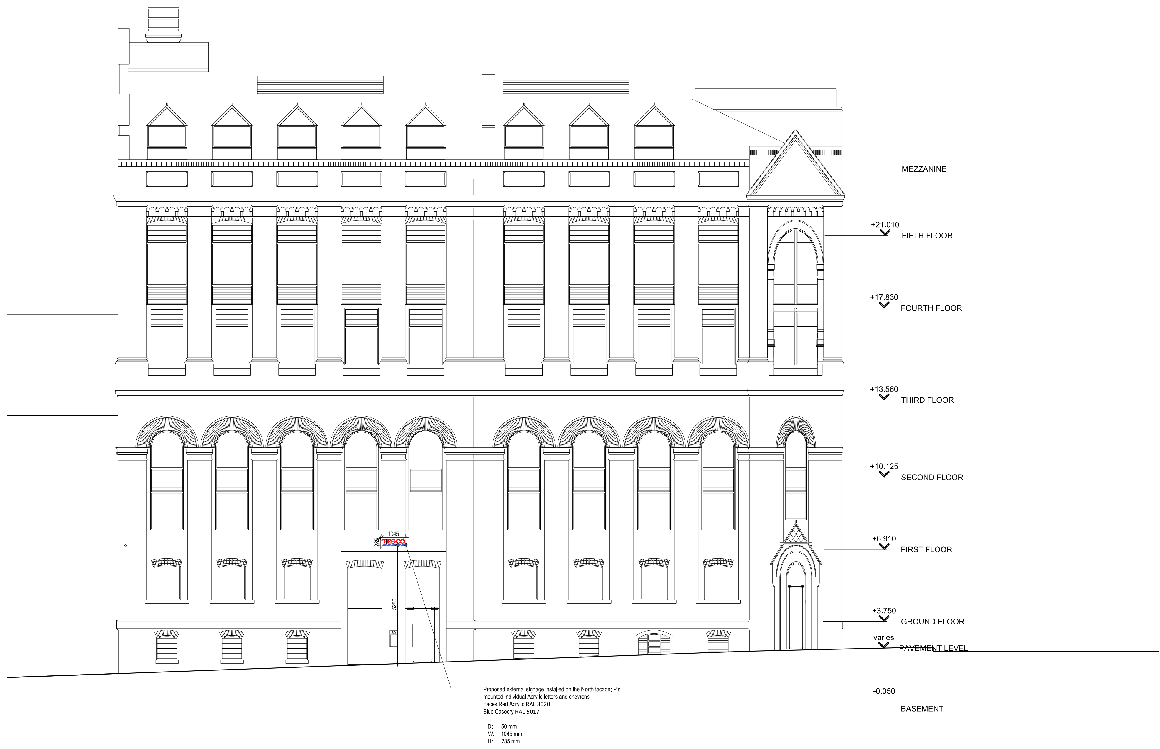
SCALE 1:100 @ A1 PROPOSED NORTH ELEVATION