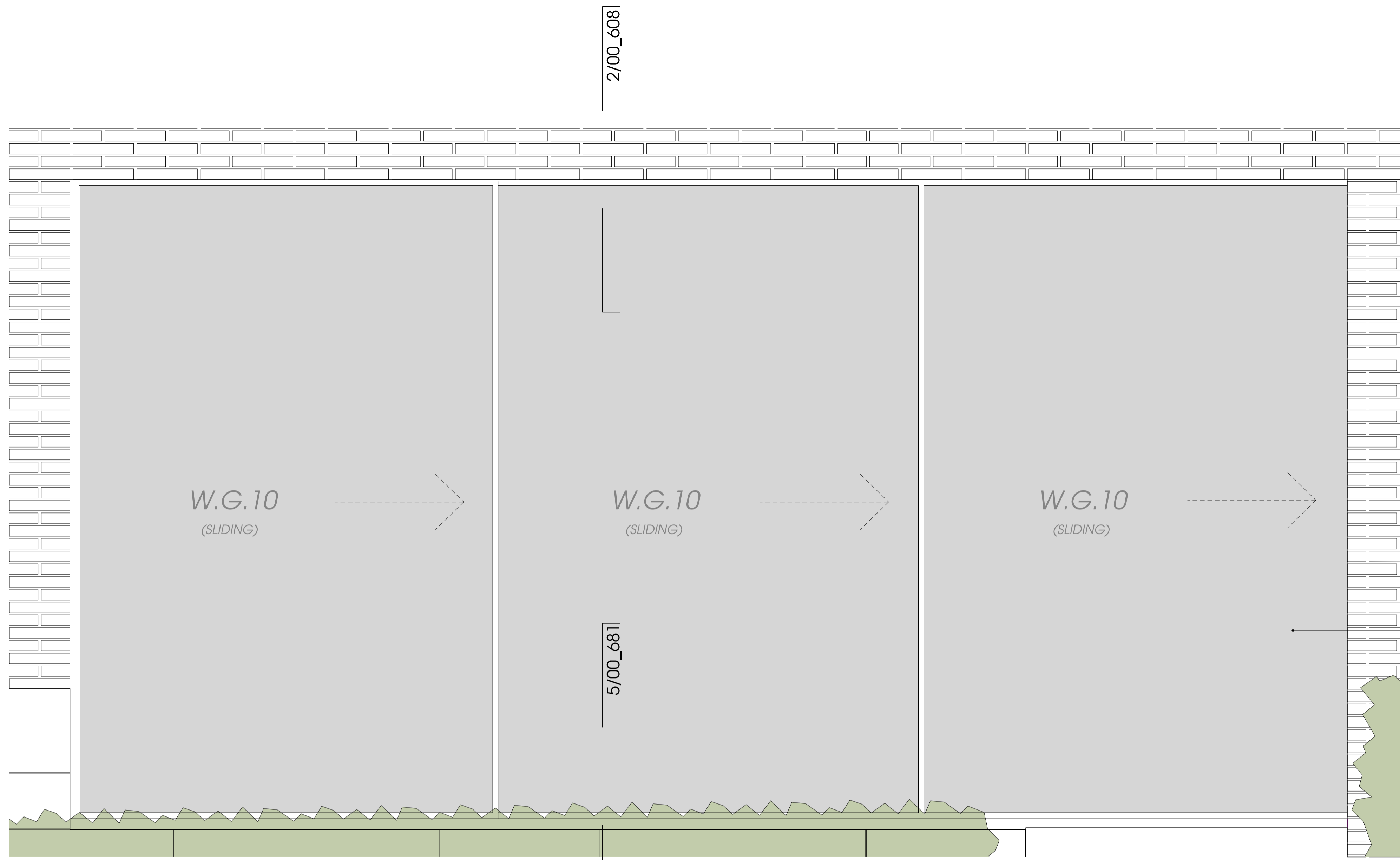
01 | W.G.10 Elevation Ground Floor South Elevation