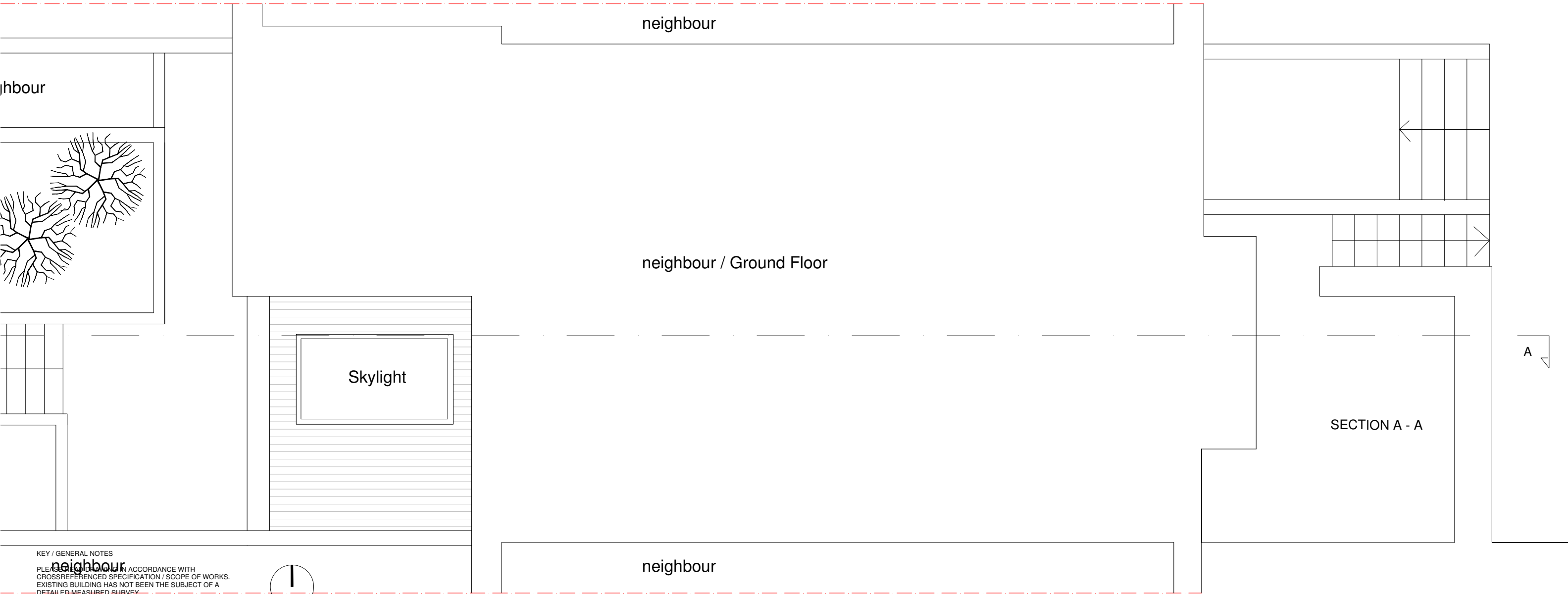
SECTION A - A

The setting night skylight used the blind to protect the neighbour windows for the reflex artificial light.