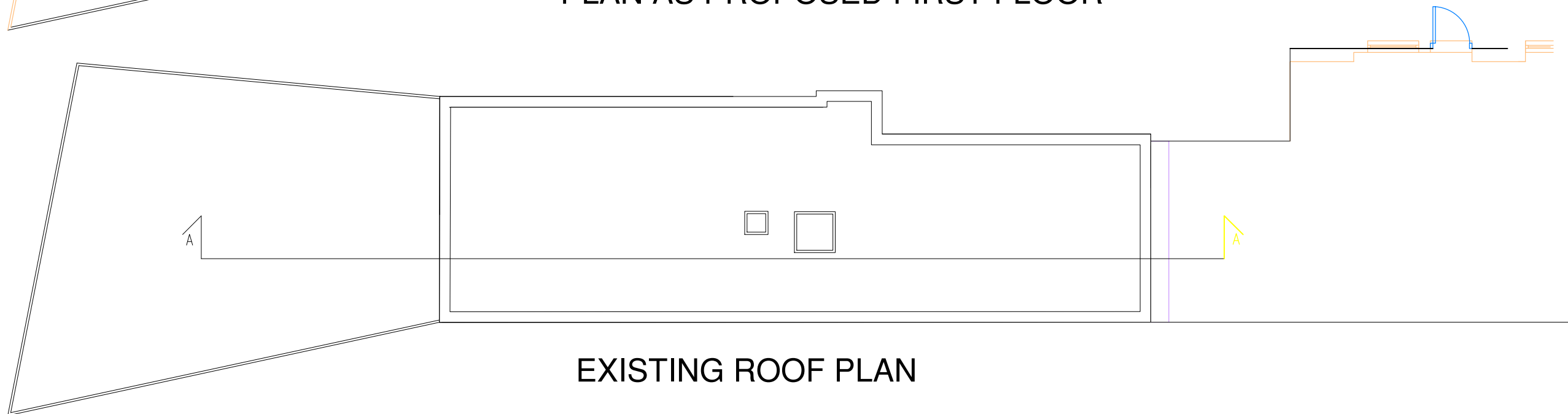
EXISTING ROOF PLAN