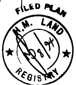
Location Plan 20 Huson Close, London, NW3 3JW Scale 1:1250