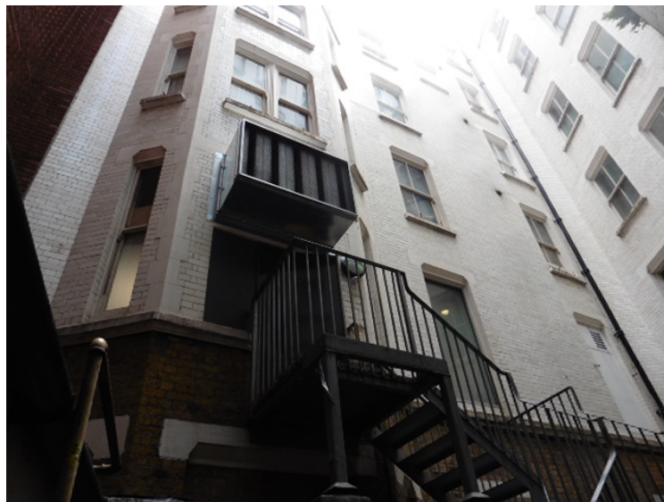
Other Plant Units in the Light well

Taken from the fire exit opposite the new Intake Attenuator