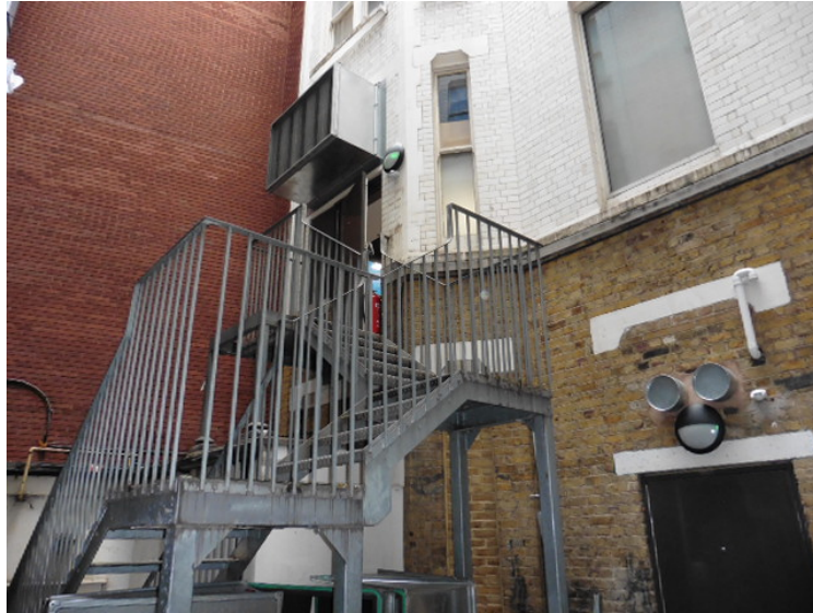
New Fresh Air Intake Attenuator 2