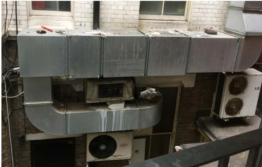
Chimney for the Air Intake for opposite unit.