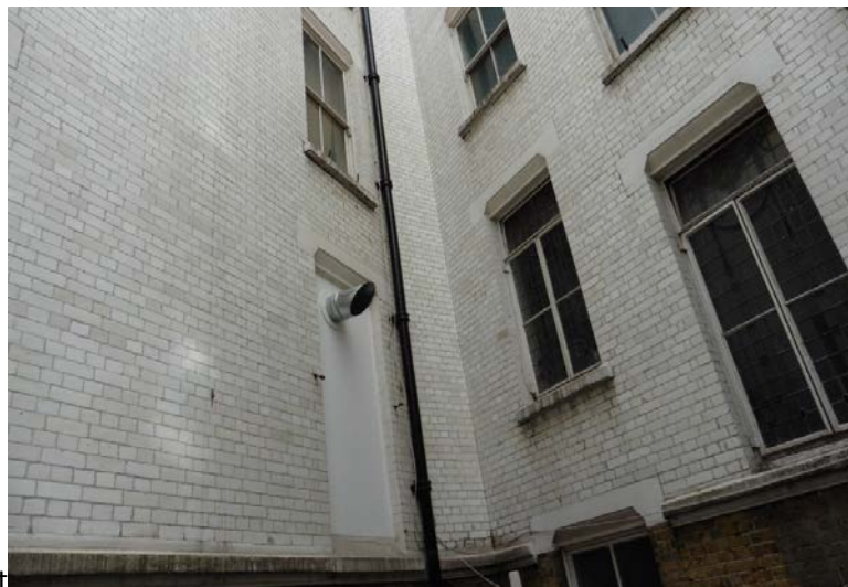
Previous W/C Exhaust