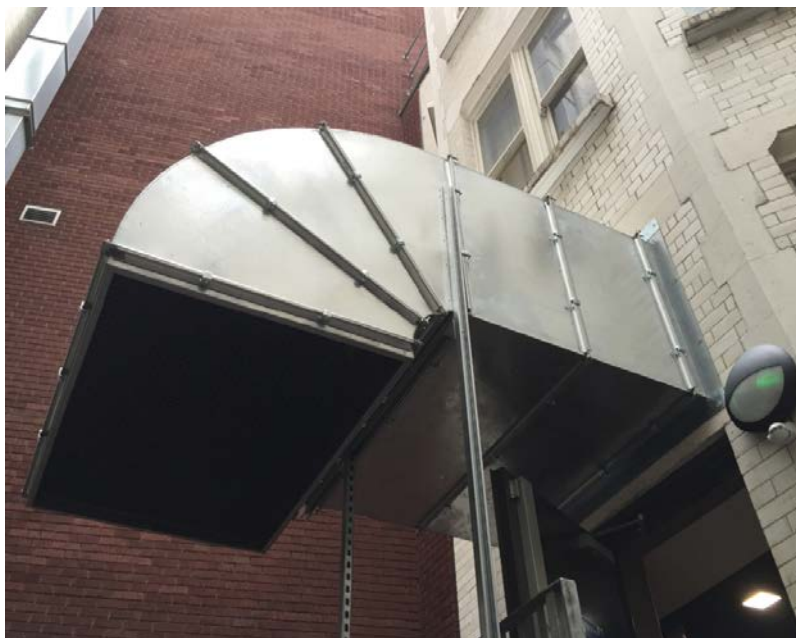
New Fresh Air Intake Attenuator 1