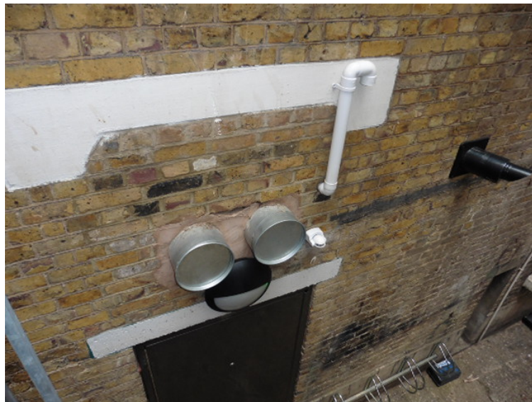
Previous Boiler Room Vents 2