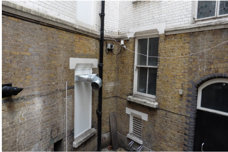
New Capped Boiler Room Vents 2