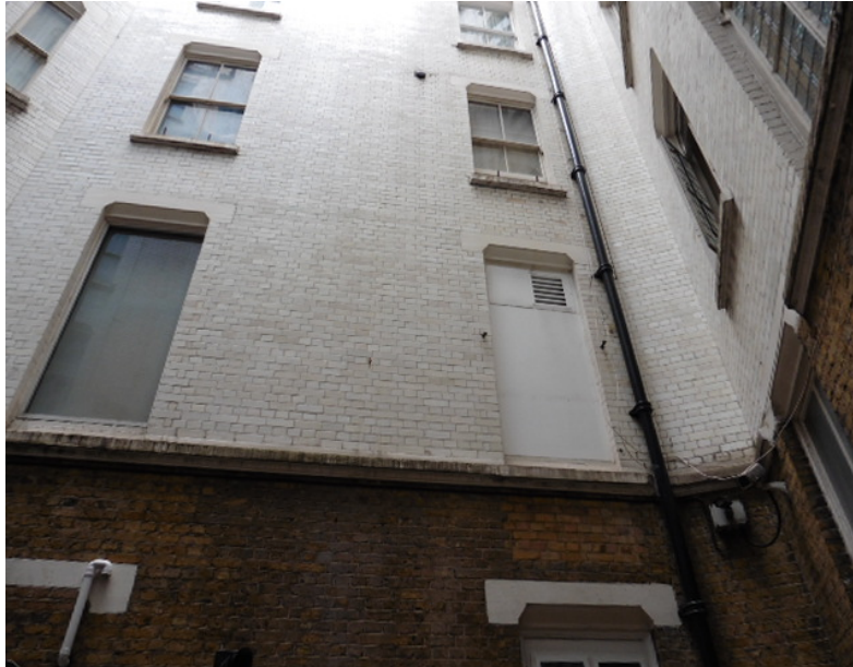
Previous Air Intake Attenuator