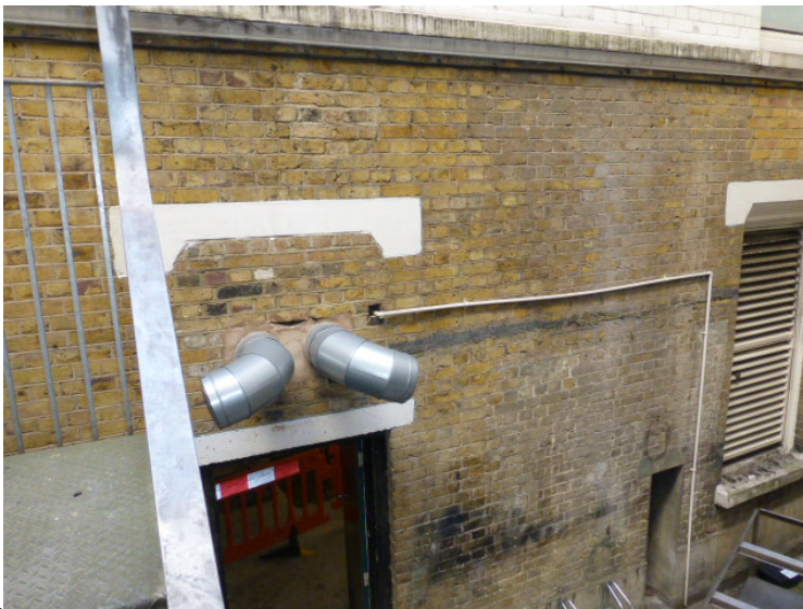
Previous Boiler Room Vents 1