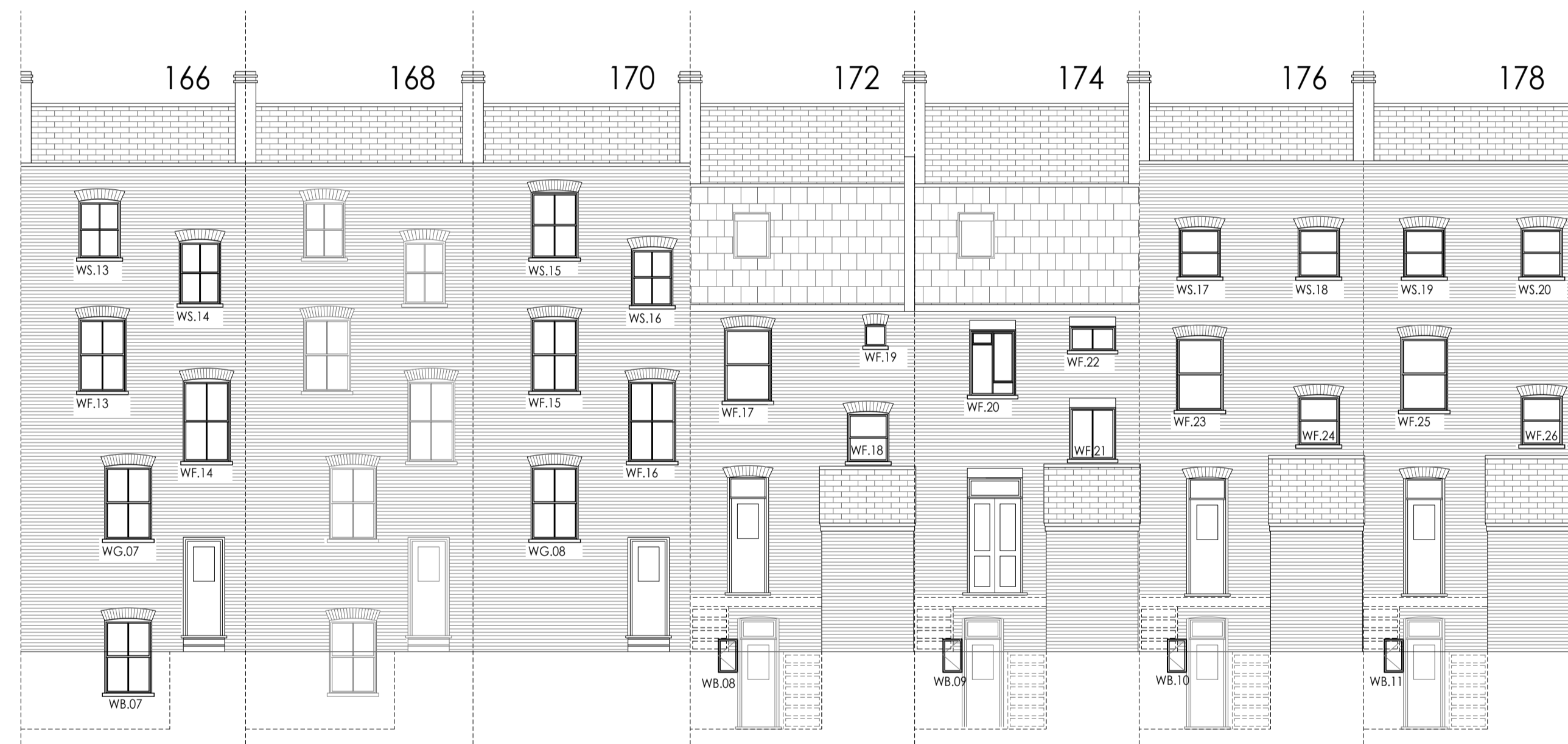
ELEVATION B-B (NORTH-EAST)