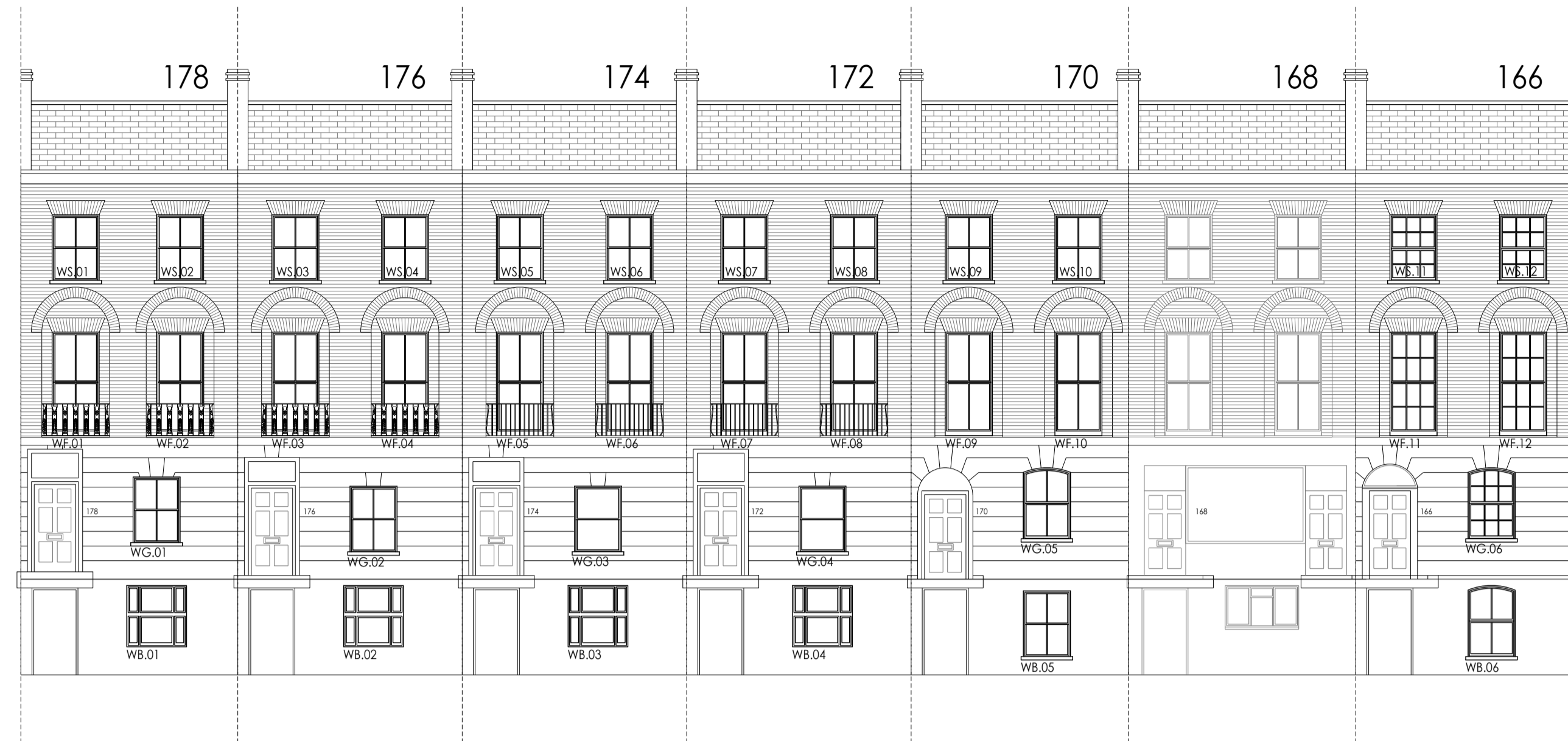
ELEVATION A-A (SOUTH-WEST)

Amendments A - CN - 28.01.2015 - UPDATED MATERIALS TO PVC FRAMES ADDED TYPE S TO BASEMENT LEVEL