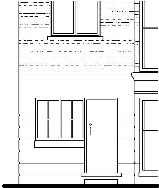
01 North Elevation As Existing 1:50