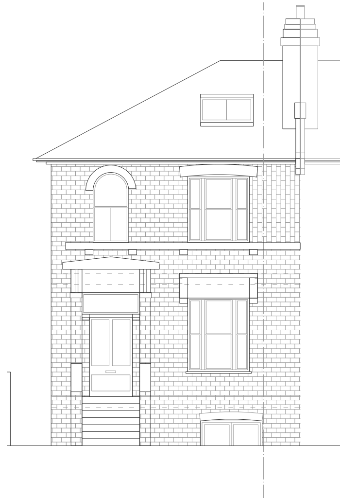
FRONT ELEVATION E: 1/100