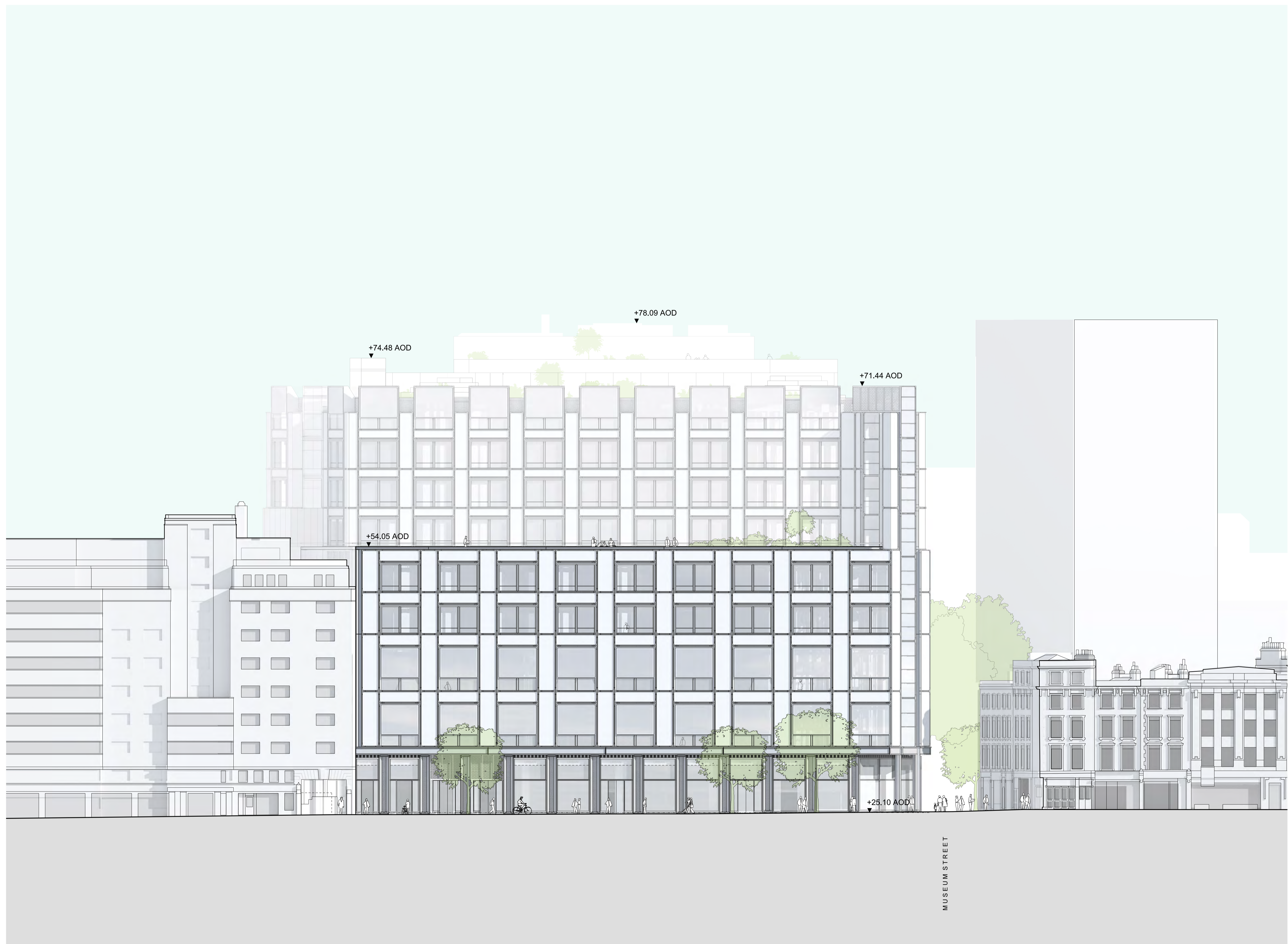
NORTH ELEVATION - PROPOSED