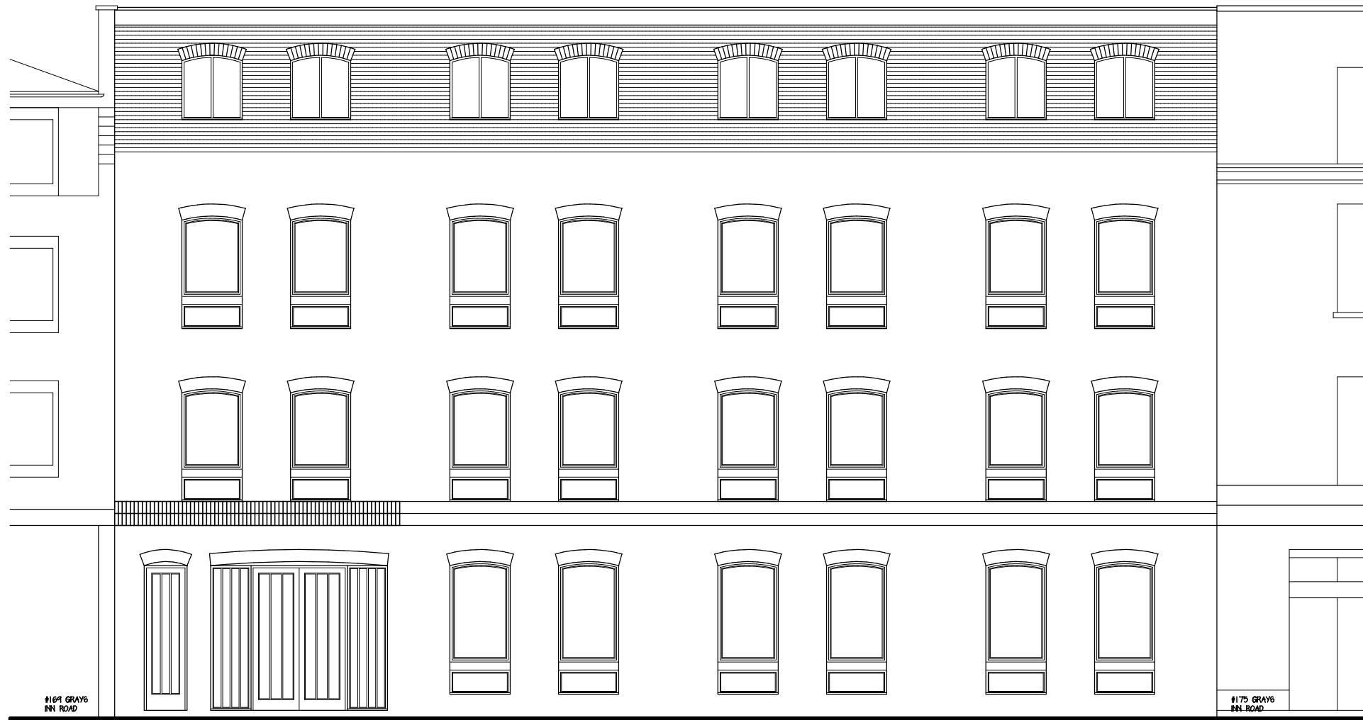
PROP. FRONT ELEVATION