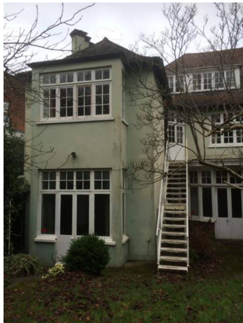
PHOTOGRAPH OF REAR VIEW