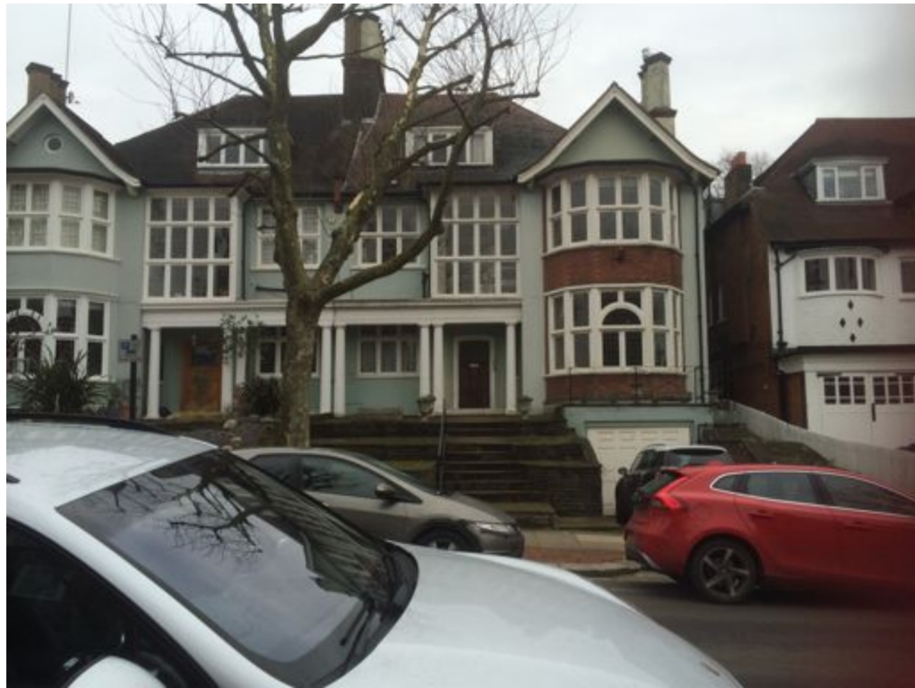
PHOTOGRAPH OF STREET VIEW