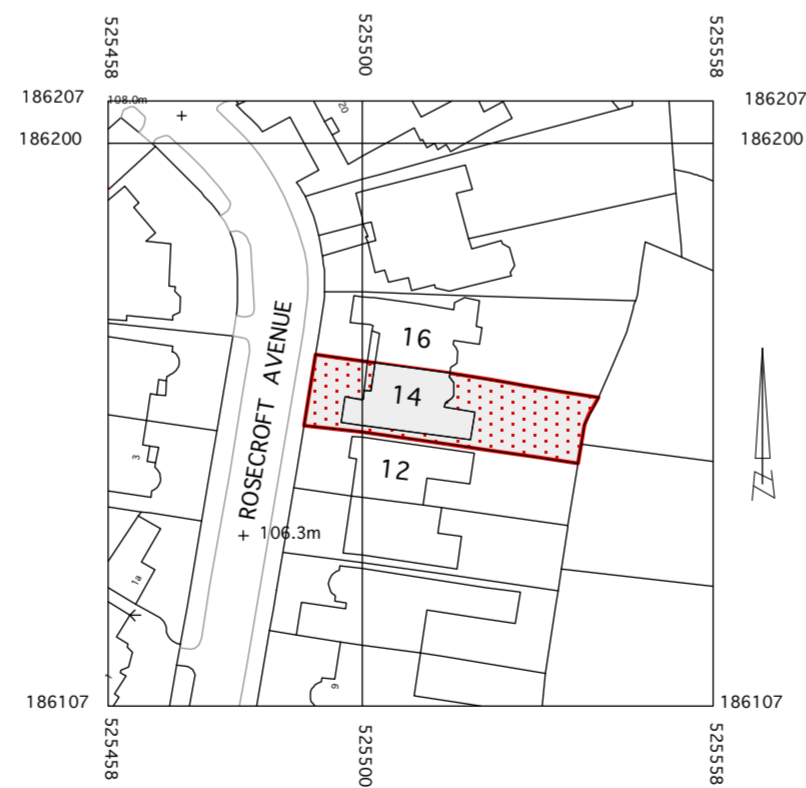
LOCATION PLAN - scale 1:1250