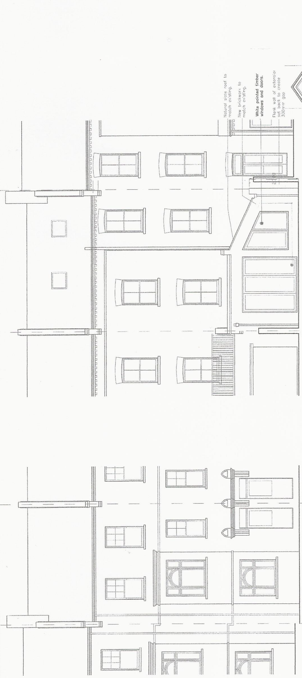
No101. Rear Elevation

Client: R. Lasserson Project Title: 101 Constantine Road London NW3 2LR Drawing Title: Proposed amendment to elevation Date: 26.01.2011 Drawn: 1:50 @ A1 Scale: 1:100 @ A3 Dwg No.: CR.01.24 C HARTLEYS PROJECTS LTD PO BOX 43391 London NE 1SZ 020 7704 8272