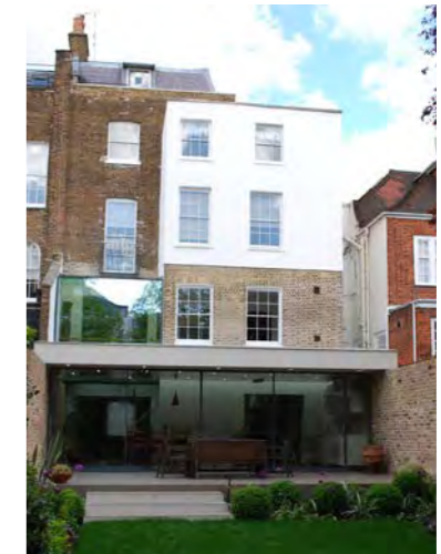
Hamilton Terrace, NW8 - Extension & modernisation of grade II listed terrace house.