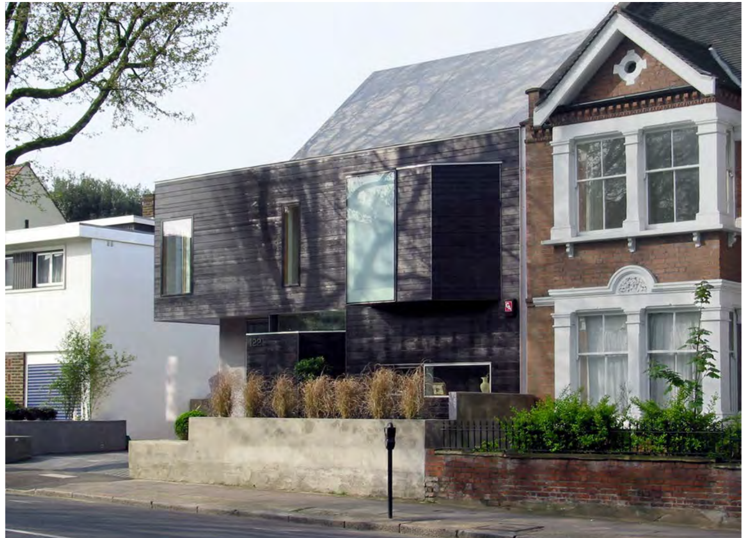
Stealth House, Grove Lane, SE4 - Manser Medal winning semi-detached house, adjoining Conservation Area.

He has received several awards, contributed to a BBC2 programme on the future of London's architecture, was a member of the LDDC Urban Design Advisory Group shaping the future of Docklands, and is active in judging architecture awards for the RIBA.