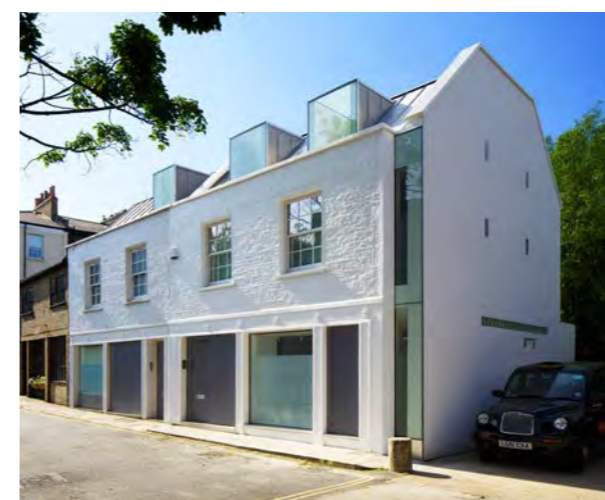
Kingstown Street, NW1 - Two neighbouring projects, both including partial rebuilds, modernisation & extensions to article 4 conservation area mews houses. Shortlisted for two 2013 Camden Design Awards 'Enhancing Context Award' and 'Don't Move, Improve Award'