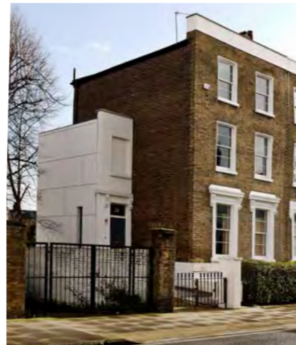
Artleigh Road N1 - Side and rear extensions to semi-detached house in a Conservation Area