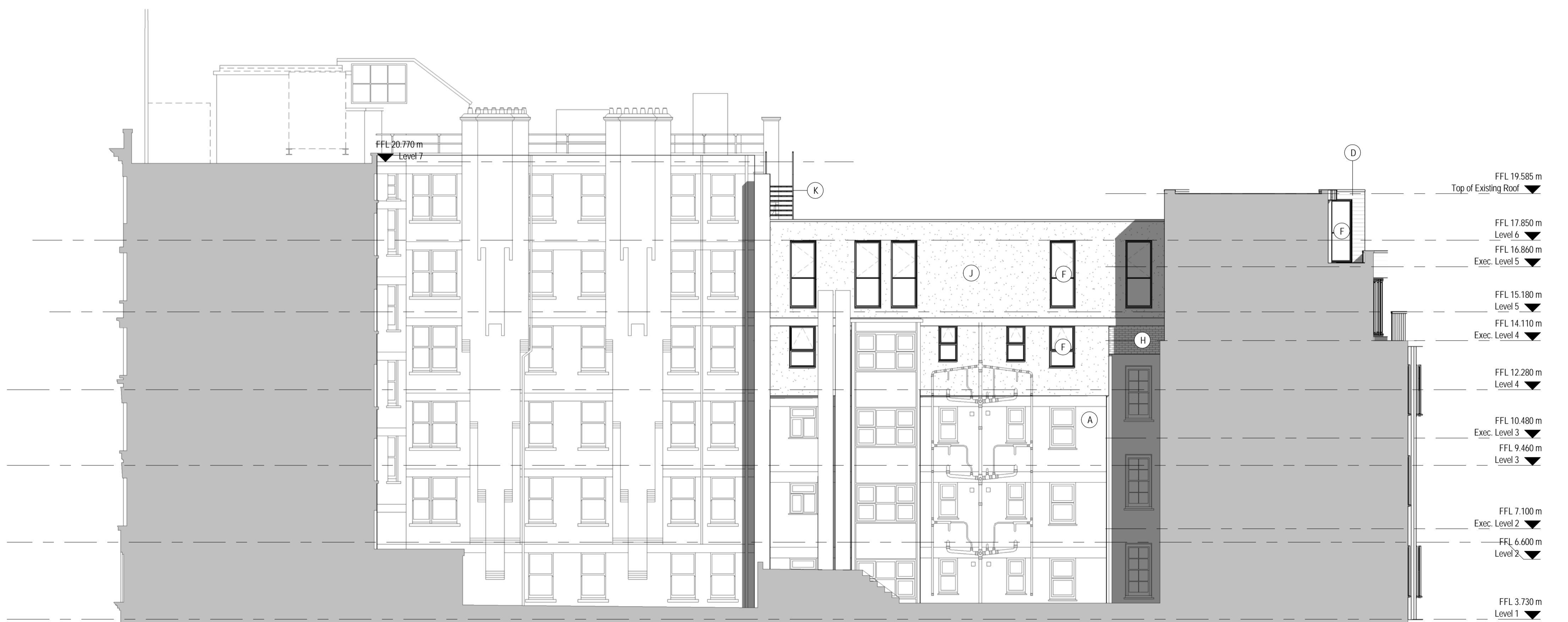
3 West Block 1 1 : 100

A West Elevation amended to show end elevation. 05.02.16 Red line included to show existing building outline.