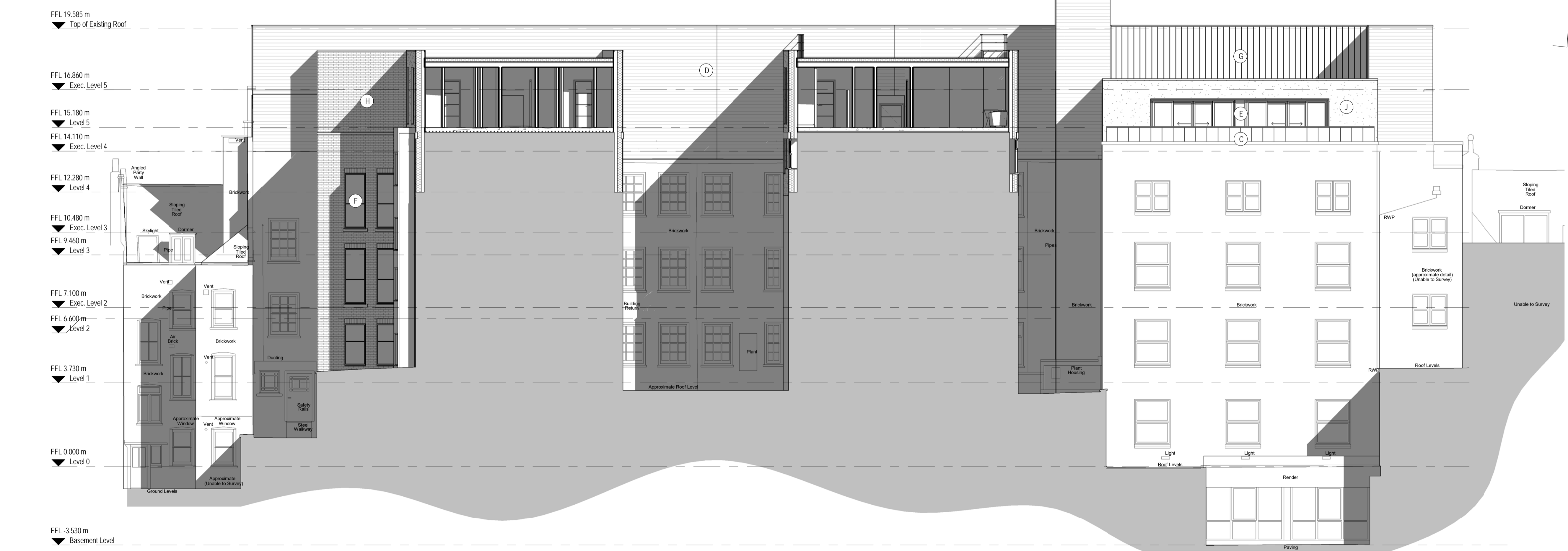
2 South 1 : 100