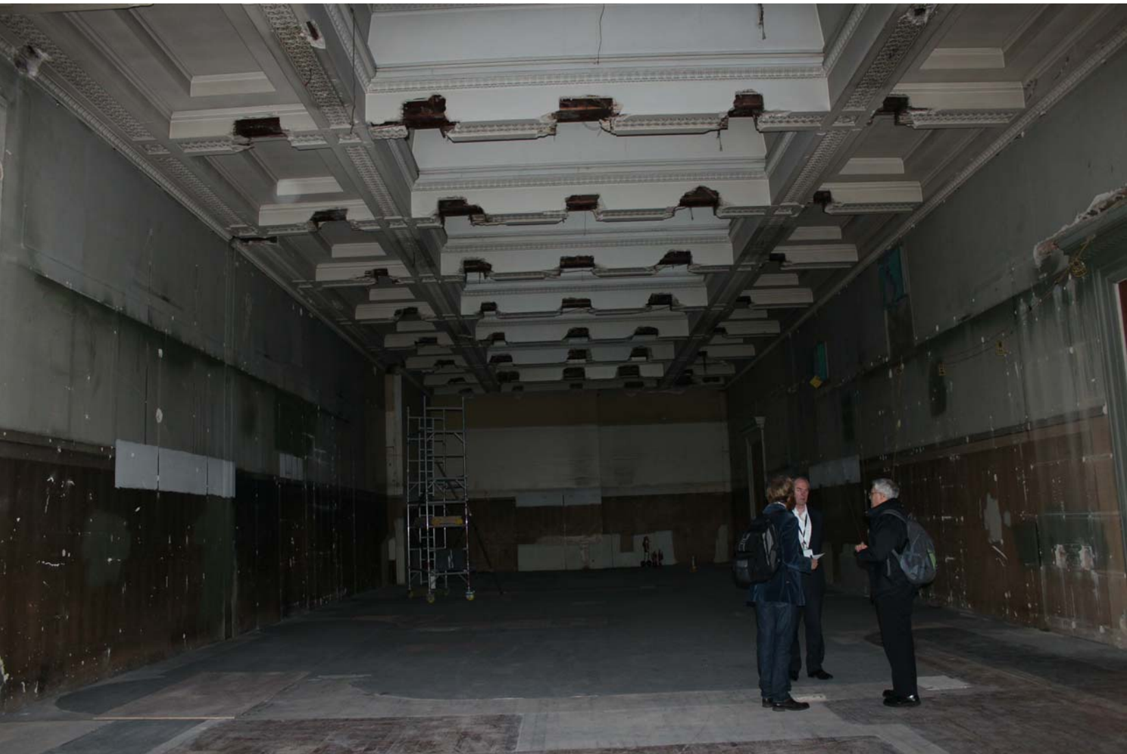
GALLERY 43-45 CEILING - SUBSTANTIAL DAMAGE TO PLASTER MOULDINGS