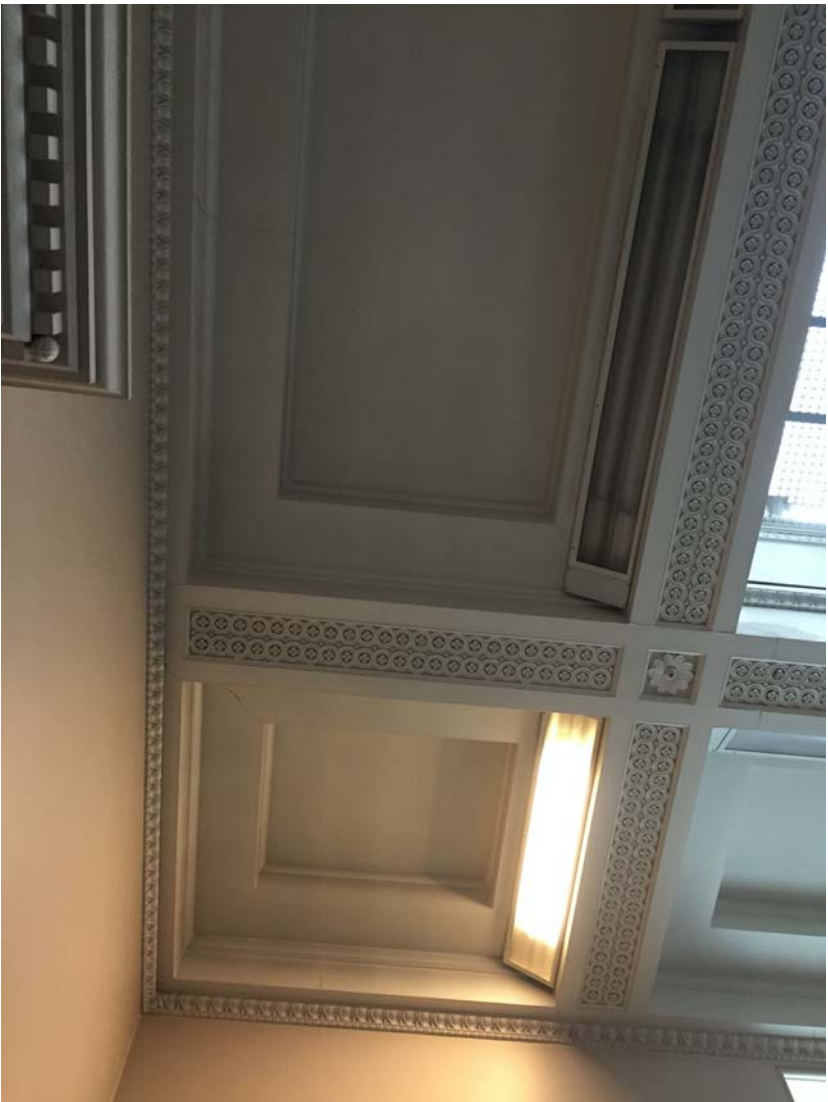
GALLERY 42 CEILING - LIGHT FITTINGS TO BE REMOVED