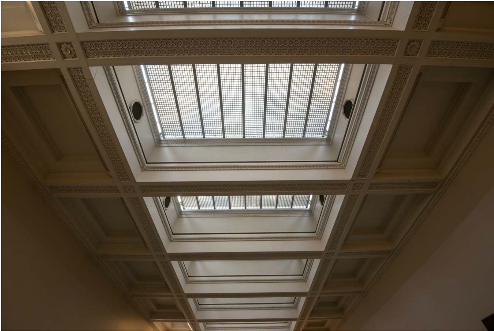
GALLERY 42 CEILING - CRACKS IN PLASTER