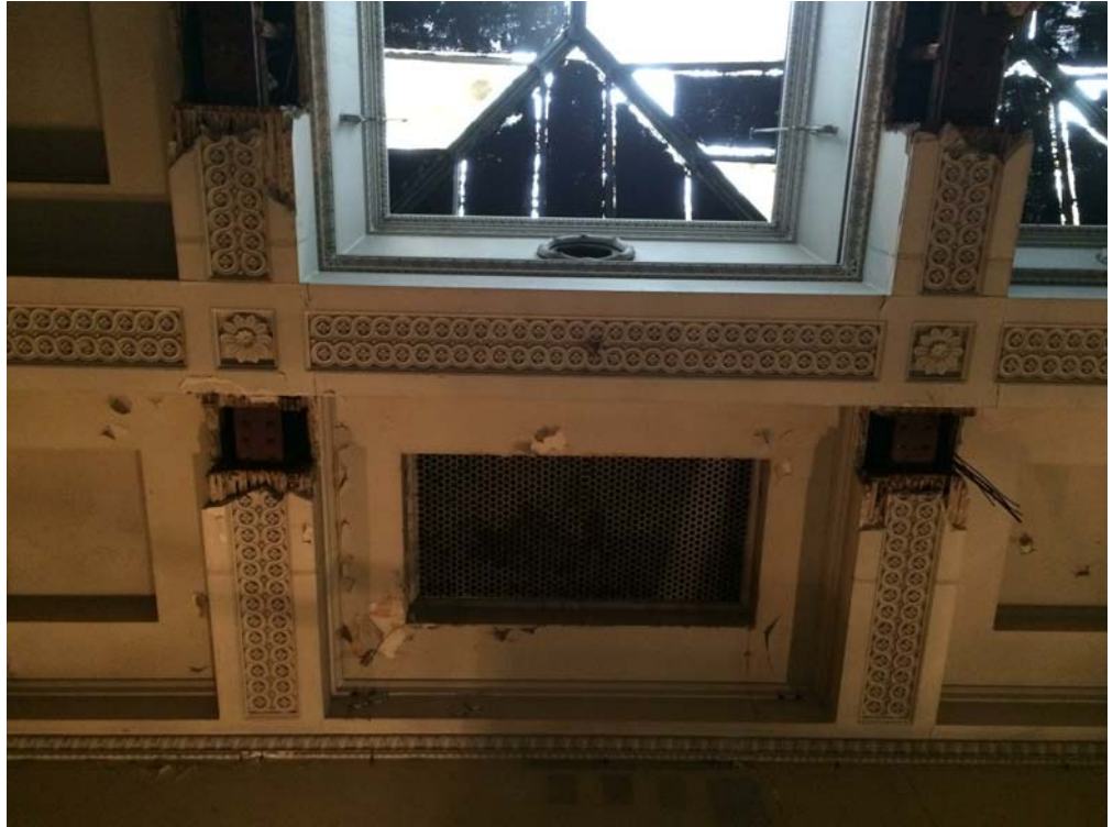
GALLERY 43-45 CEILING - GRILL IN CEILING TO BE REMOVED AND PLASTER FINISH RESTORED