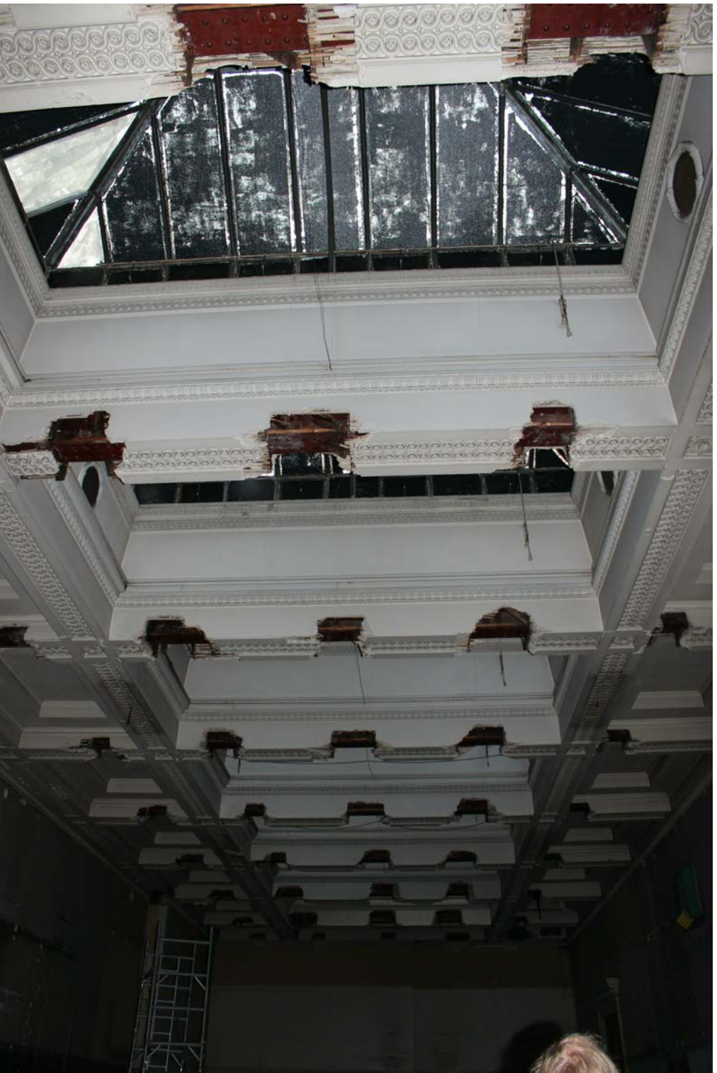
GALLERY 43-45 CEILING - CAST IRON BEAMS VISIBLE