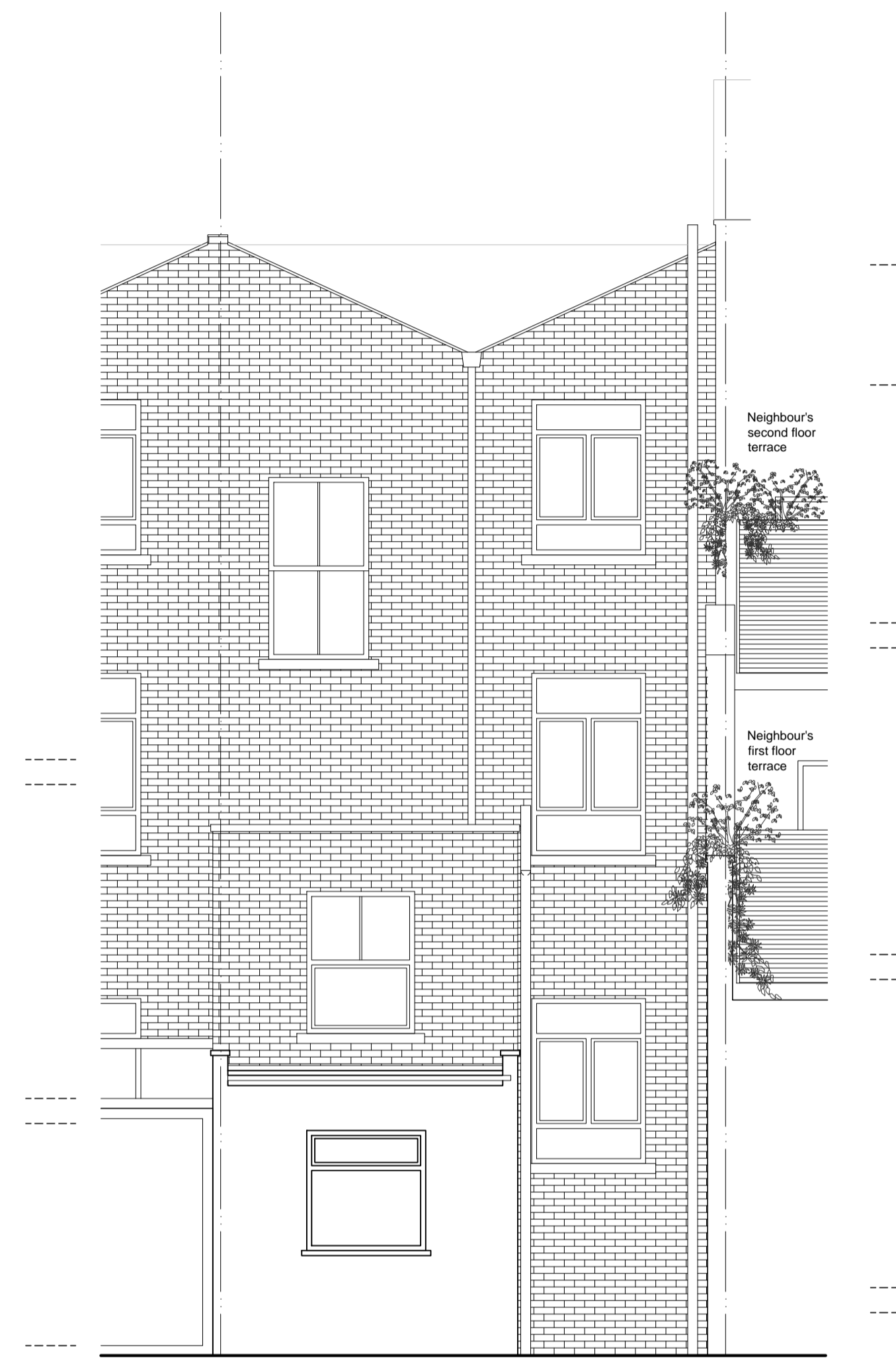
Existing Rear Elevation Scale 1:50