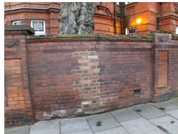
28 ARKWRIGHT ROAD - EXTERNAL TREE DAMAGE WALL PANEL PLATE 1