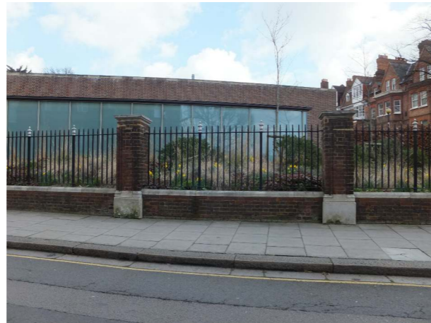
UNIVERSITY COLLEGE SCHOOL BOUNDARY TO FROGNAL PLATE 2