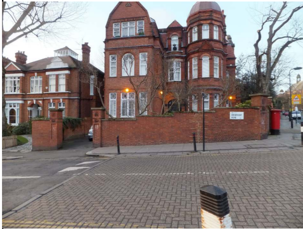
28 ARKWRIGHT ROAD - EXTERNAL FRONT OF BUILDING

This drawing is to be read in conjunction with Drawings 110 - 115 and 117