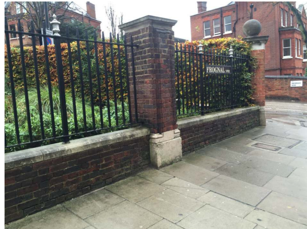
UNIVERSITY COLLEGE SCHOOL BOUNDARY TO FROGNAL PLATE 1