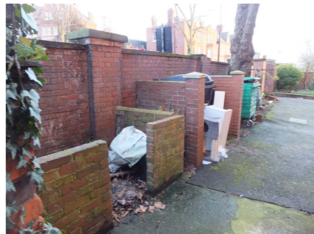
28 ARKWRIGHT ROAD - INTERNAL BOUNDARY TO FROGNAL PLATE 2