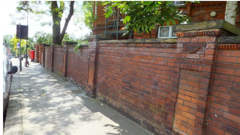
28 ARKWRIGHT ROAD - EXTERNAL BOUNDARY TO FROGNAL PLATE 1