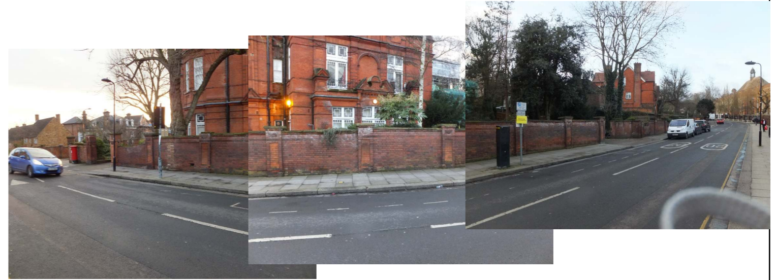
28 ARKWRIGHT ROAD - EXTERNAL BOUNDARY TO FROGNAL PLATE 2