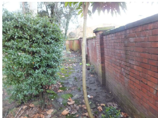
28 ARKWRIGHT ROAD - INTERNAL BOUNDARY TO FROGNAL PLATE 1