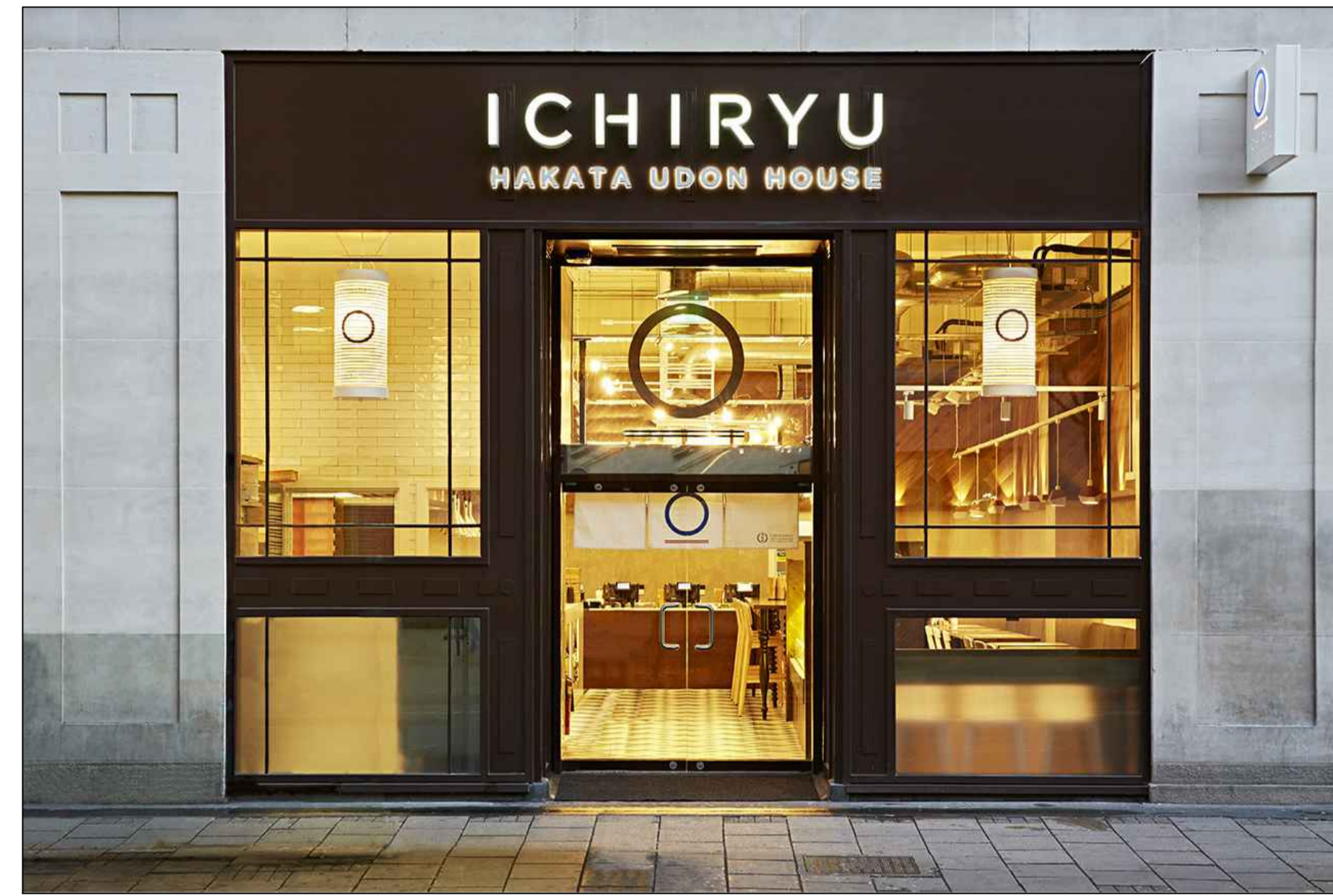
04 EXISTING SHOPFRONT IMAGE not to scale