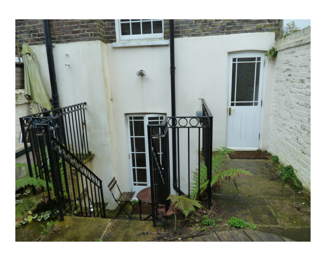
View of the rear of the house.