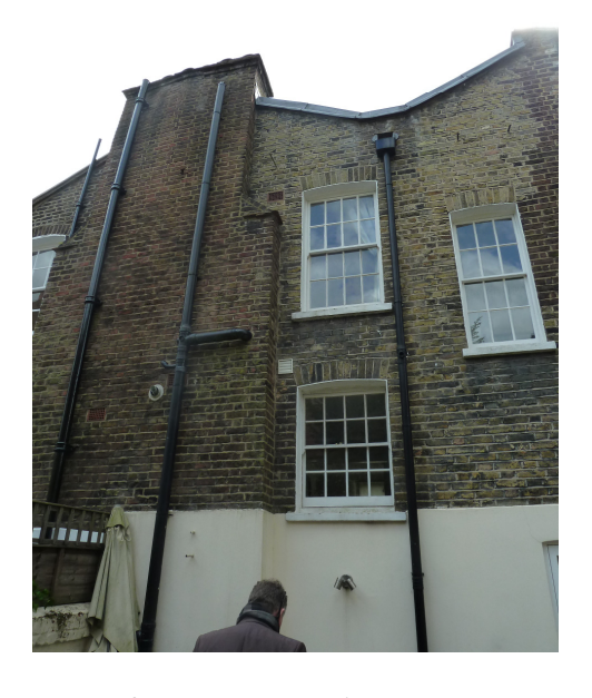
Rear of house and chimney breast.