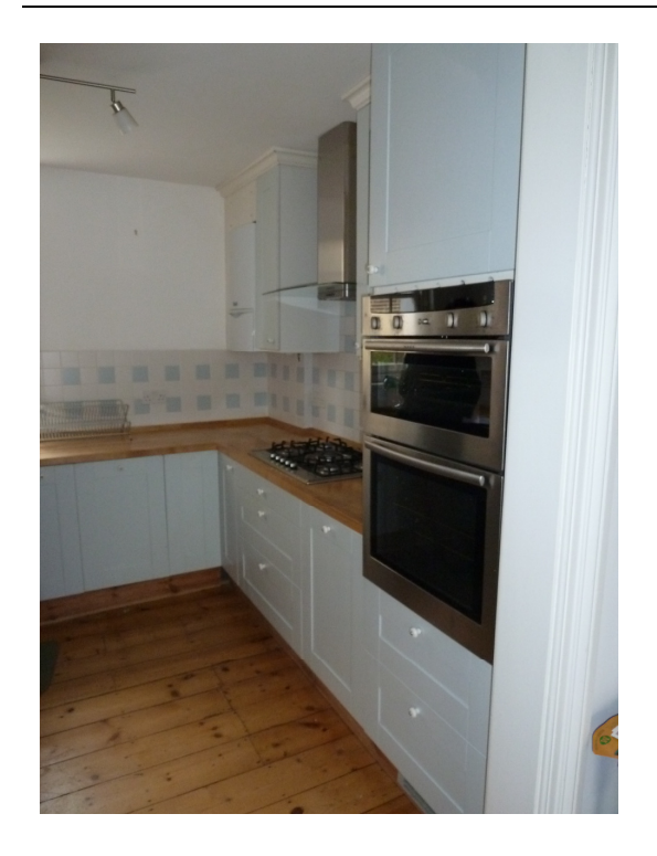
Kitchen with boiler in the corner.