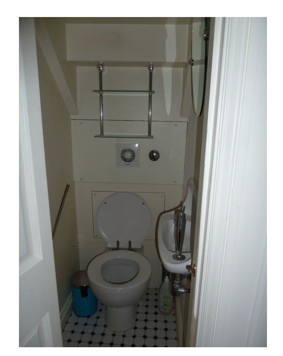
Existing cramped WC under the stair.