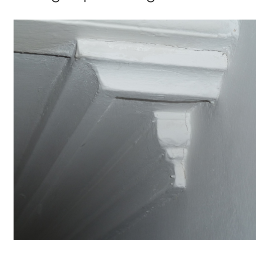
Existing cornice on ground floor.