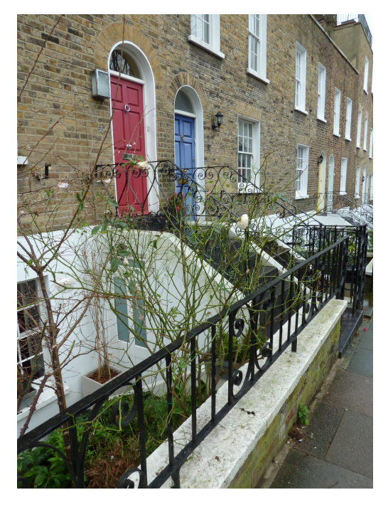
57 Flask Walk with semi-glazed door under the front steps.