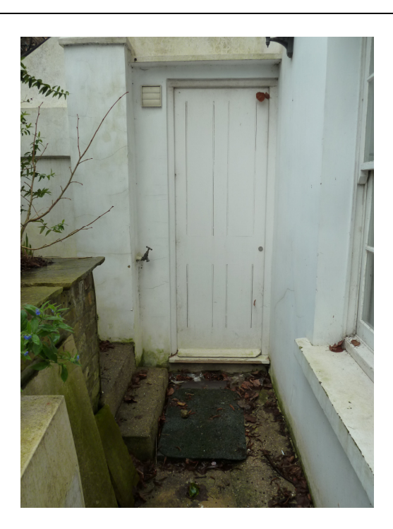
Door and front light well.