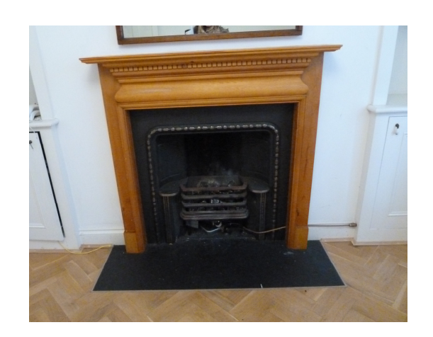
Existing fireplace on basement floor.