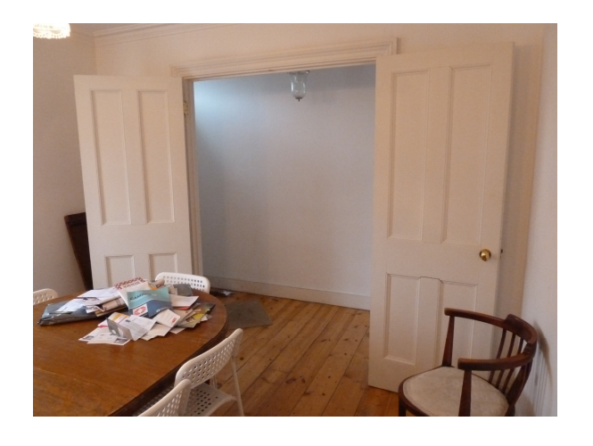
Double doors in front ground floor room.