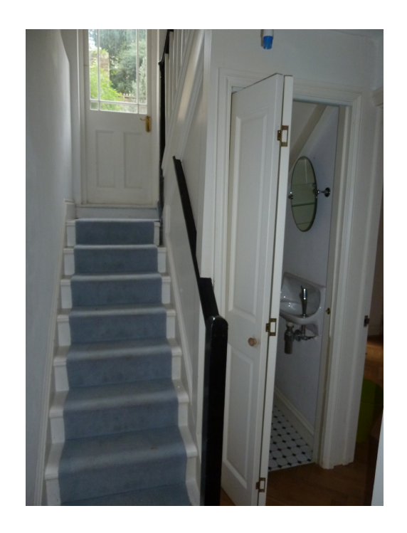
Original stair and door to rear garden.