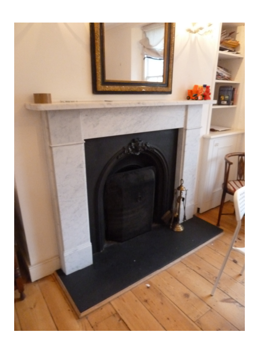
Existing fireplace on ground floor.