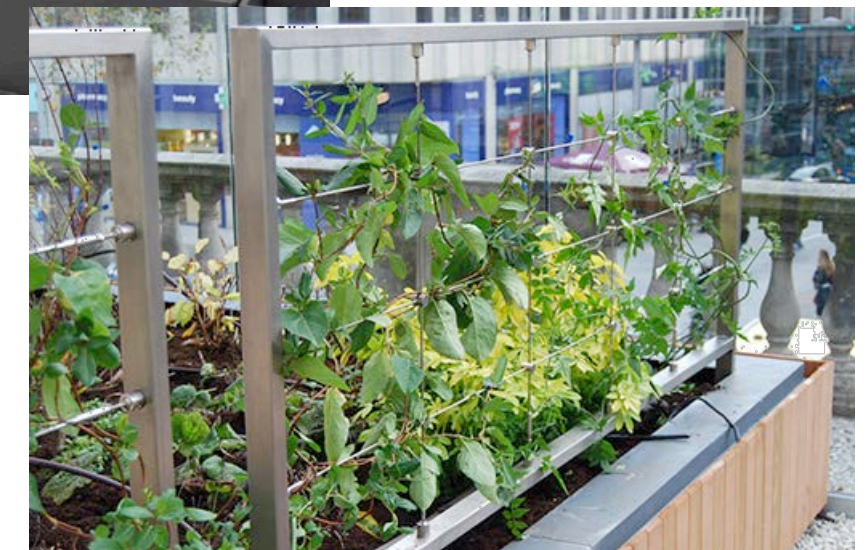
Example metal trellis system